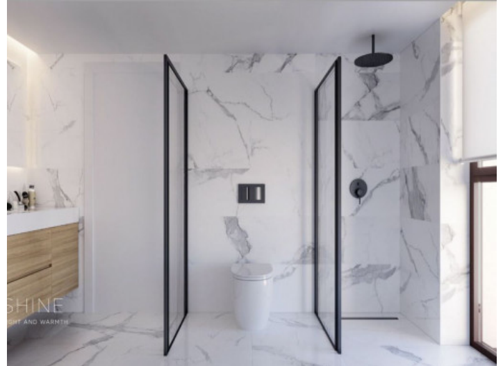
Bathroom - Shine