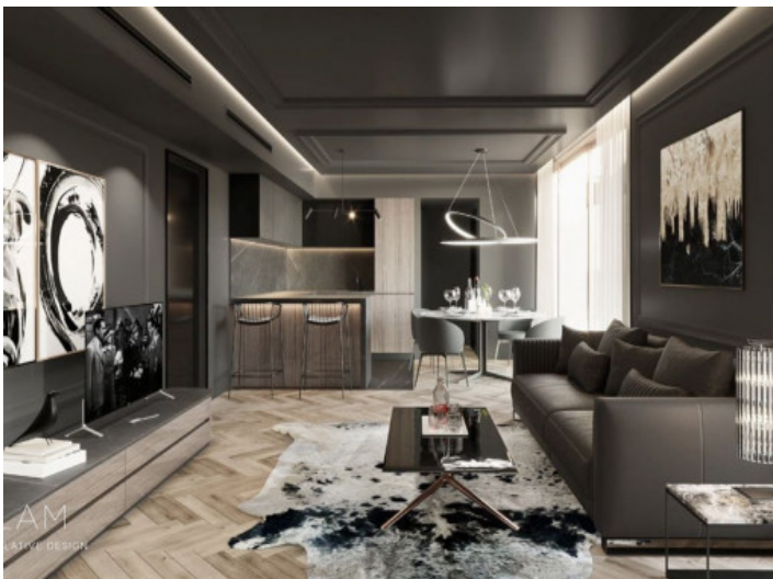
Living and dining area - Glam