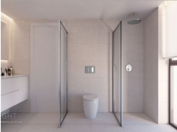
Bathroom - Light