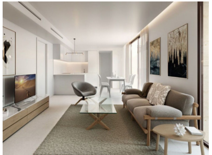
Living and dining area - Light