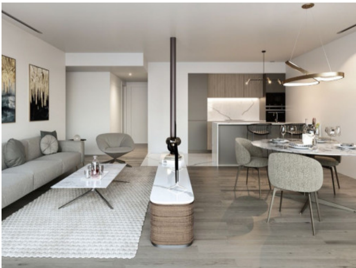
Living and dining area - Shine