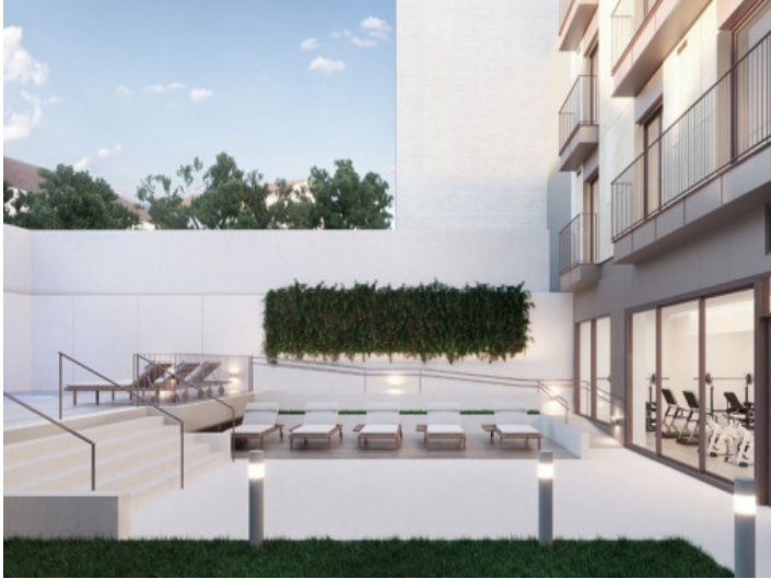
Terrace, pool and gym area