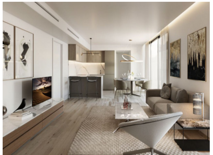
Living and dining area - Light

All information is correct to the best of our knowledge. Errors and prior sale excepted. This prospectus is purely for information purposes. Only the notarized deed of sale is legally binding.