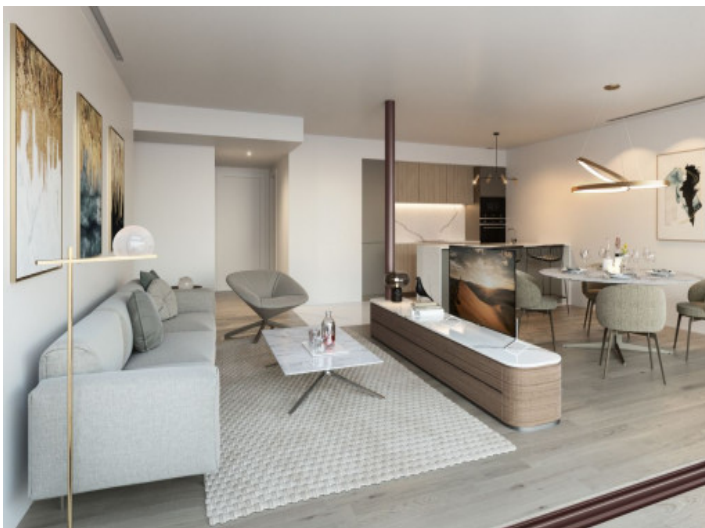
Living and dining area - Shine