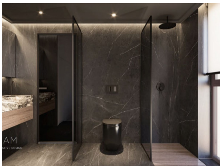
Bathroom - Glam