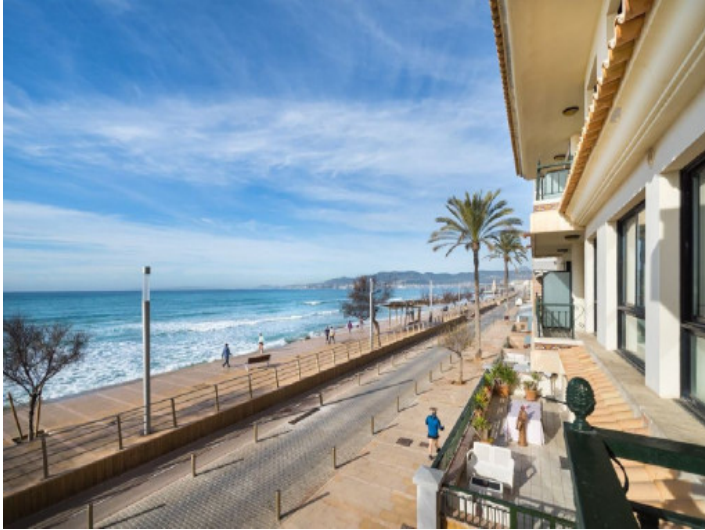
Balcony with sea views