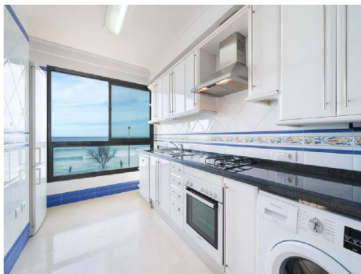
Kitchen with sea views