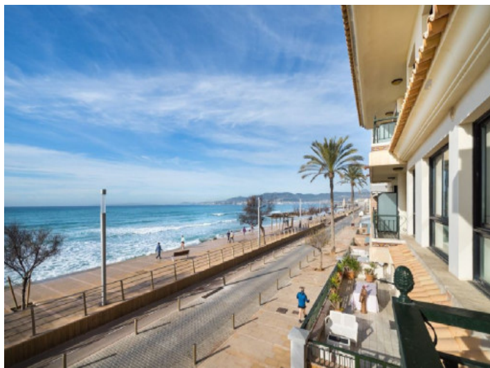
Balcony with sea views