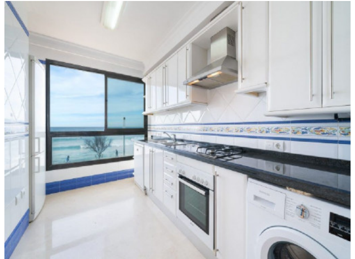
Kitchen with sea views