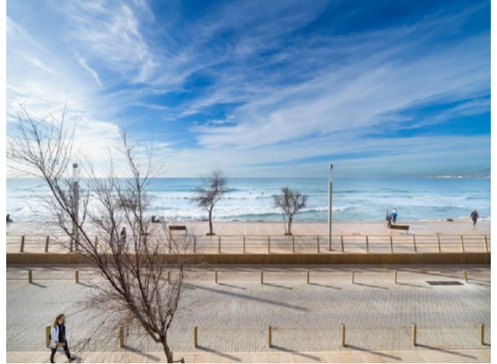
View to the promenade