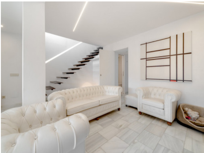
Living area with stairs to the upper floor