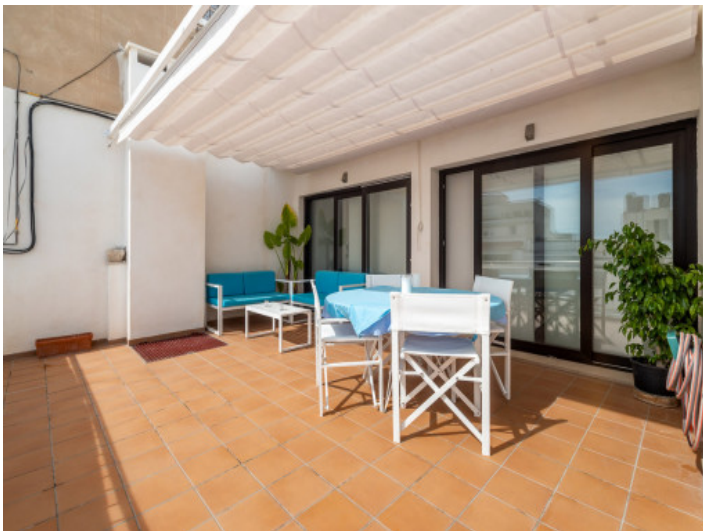
Spacious sun terrace