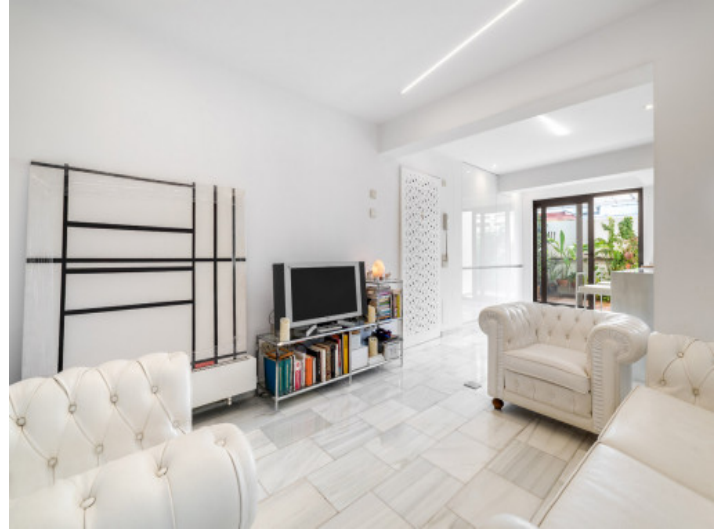
Adjoining, open living area