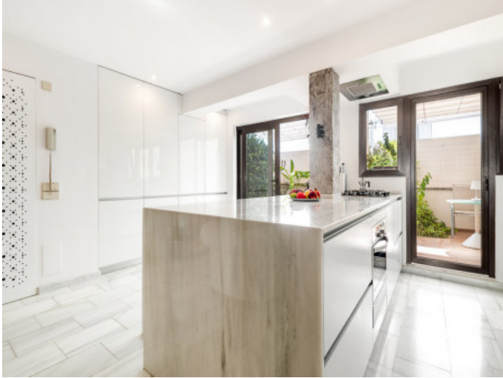
Modern kitchen with terrace access