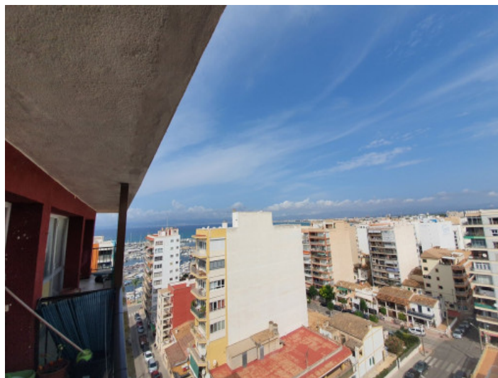
Views as far as the sea