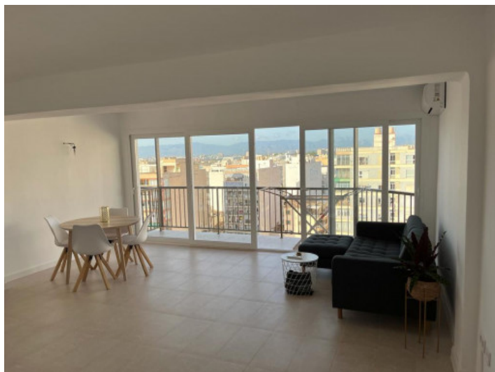
Living area with large window facade