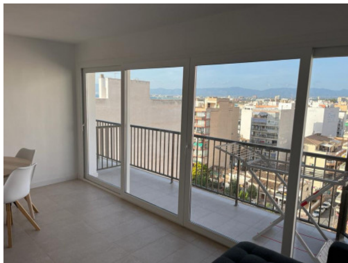
Living area and balcony