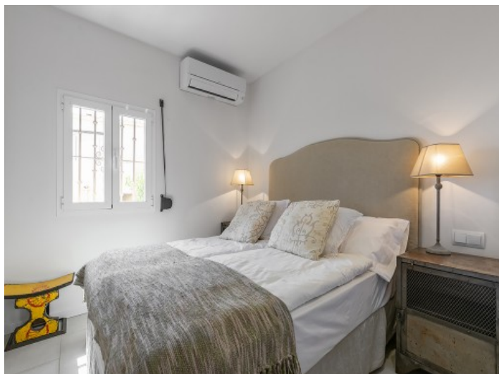
First double bedroom