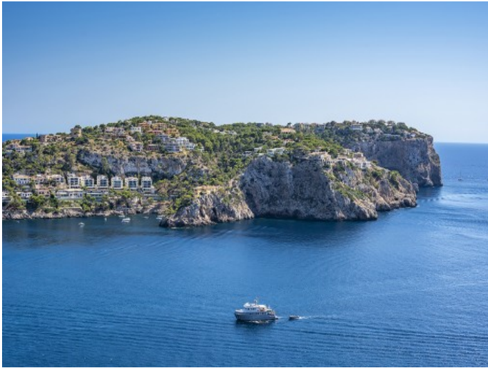
Breathtaking views of the open sea