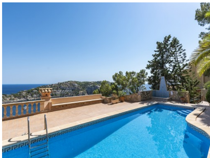
Communal pool in a unique location

All information is correct to the best of our knowledge. Errors and prior sale excepted. This prospectus is purely for information purposes. Only the notarized deed of sale is legally binding.