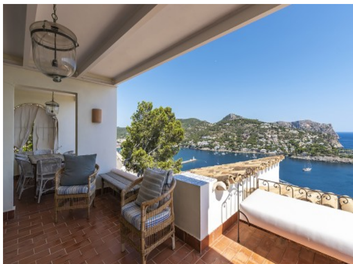
Terrace with various seating areas