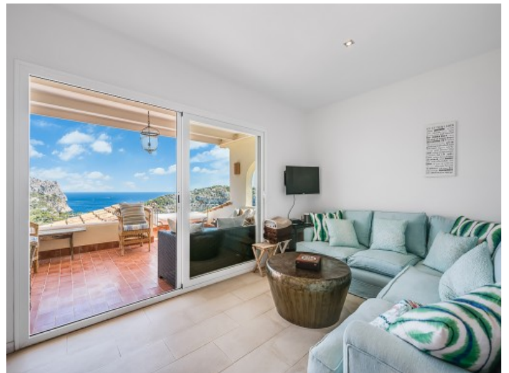
Living area with direct terrace access