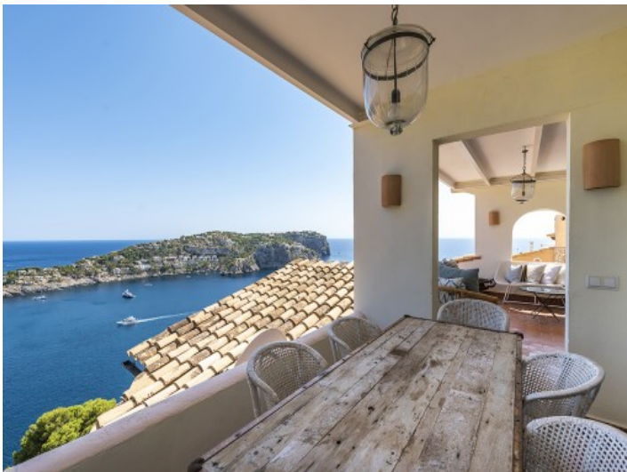
Dining area with fantastic sea views