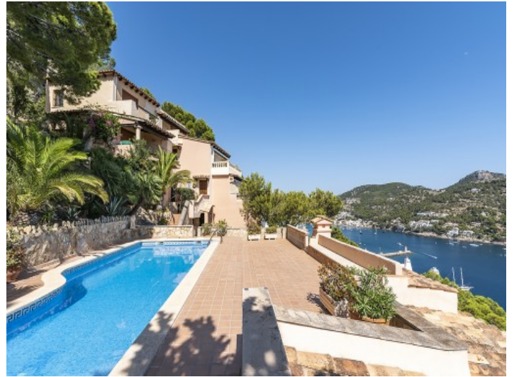
Well-maintained complex with pool