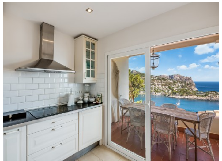
Access to the outdoor dining area

All information is correct to the best of our knowledge. Errors and prior sale excepted. This prospectus is purely for information purposes. Only the notarized deed of sale is legally binding.