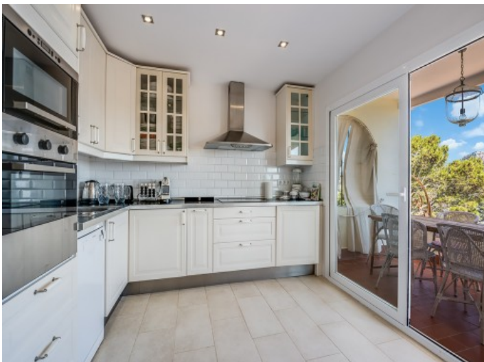
Modern, spacious kitchen