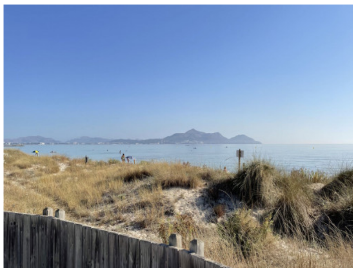
Playa de Muro