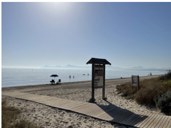
Playa de Muro