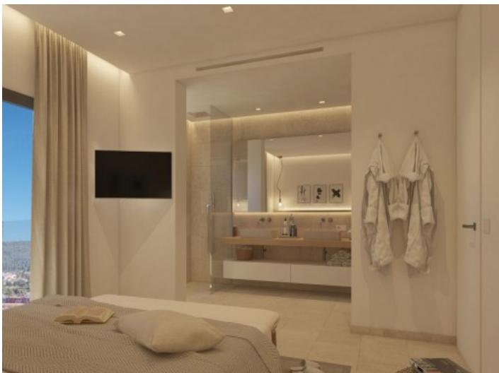
Master bedroom with bathroom en suite