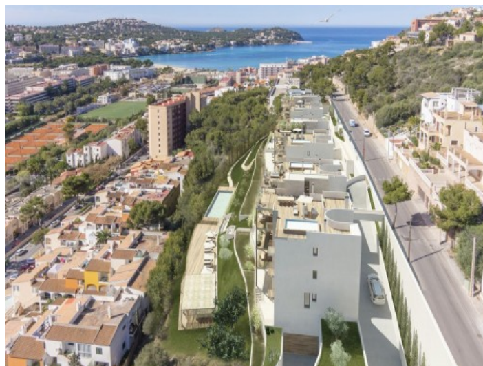
Fantastic sea views

All information is correct to the best of our knowledge. Errors and prior sale excepted. This prospectus is purely for information purposes. Only the notarized deed of sale is legally binding.