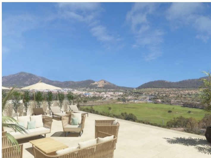
Terrace with a view