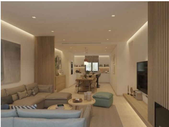
Alternative view of the living area