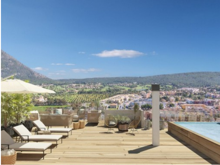
Sun loungers at the pool area