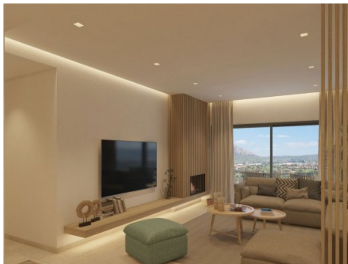
Open living area with large windows