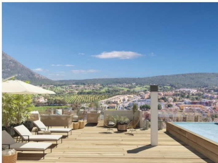
Sun loungers at the pool area