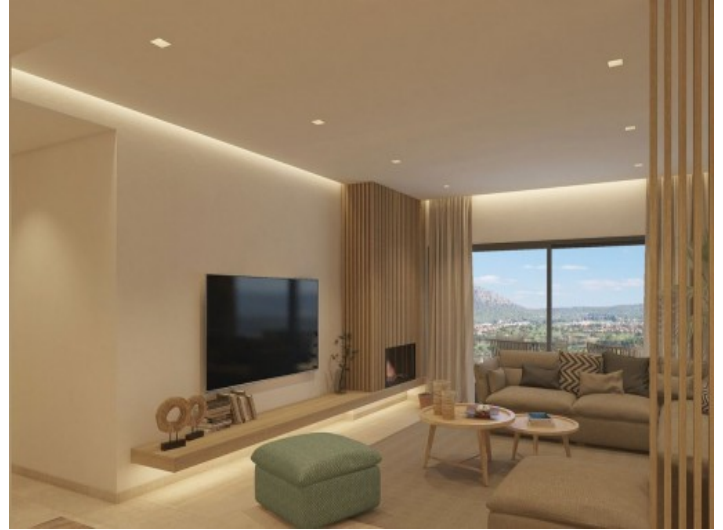
Open living area with large windows