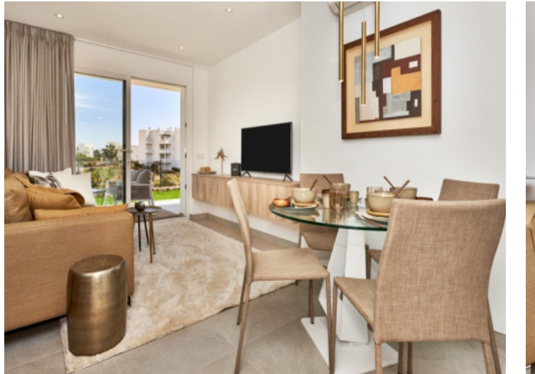
Living area Living area All information is correct to the best of our knowledge. Errors and prior sale excepted. This prospectus is purely for information purposes. Only the notarized deed of sale is legally binding.

PORTA MALLORQUINA • THERESIENSTR.: 81, 80333 MUNICH TEL. +34 971 698 242 • INFO@PORTAMALLORQUINA.COM