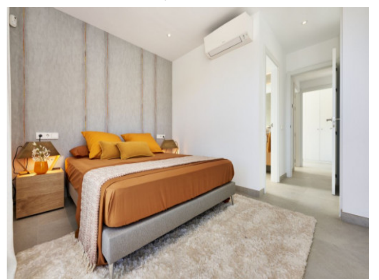
Master bedroom Bedroom All information is correct to the best of our knowledge. Errors and prior sale excepted. This prospectus is purely for information purposes. Only the notarized deed of sale is legally binding.

PORTA MALLORQUINA • THERESIENSTR.: 81, 80333 MUNICH TEL. +34 971 698 242 • INFO@PORTAMALLORQUINA.COM