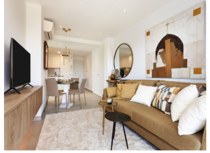
Living room overlooking the kitchen