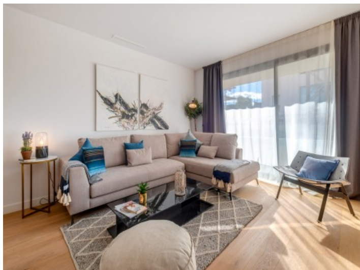
Modern living area