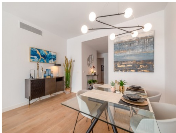
Adjoining dining area