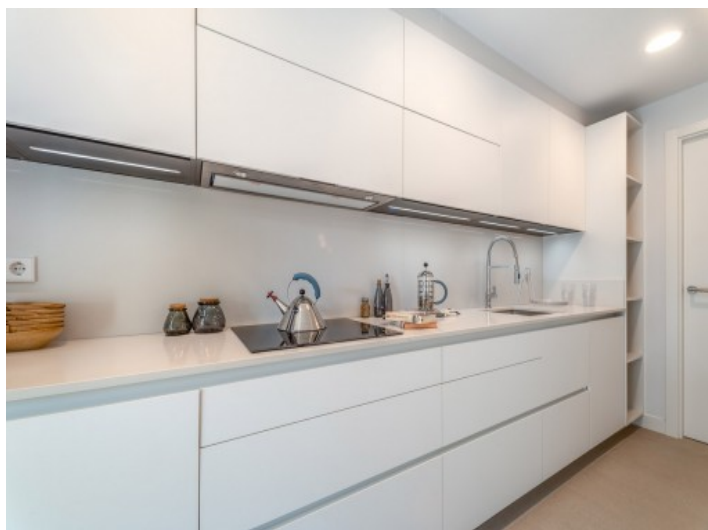
High quality kitchen