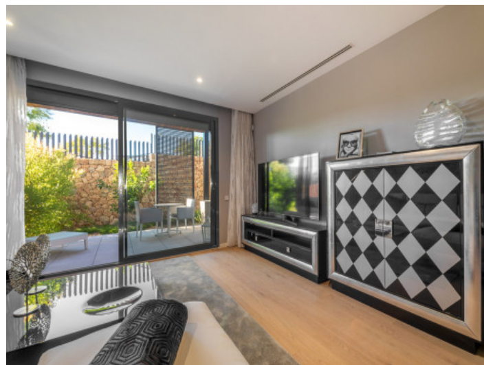
Direct terrace access