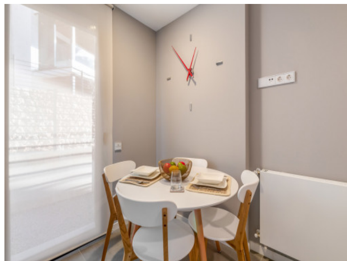
Small dining area

All information is correct to the best of our knowledge. Errors and prior sale excepted. This prospectus is purely for information purposes. Only the notarized deed of sale is legally binding.