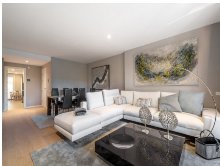
Spacious living and dining area