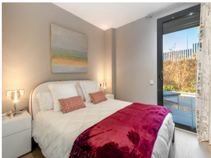
Bedroom with terrace access