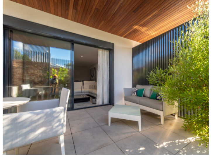
Covered main terrace