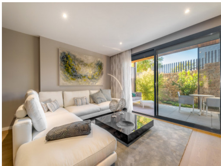
Modern living area