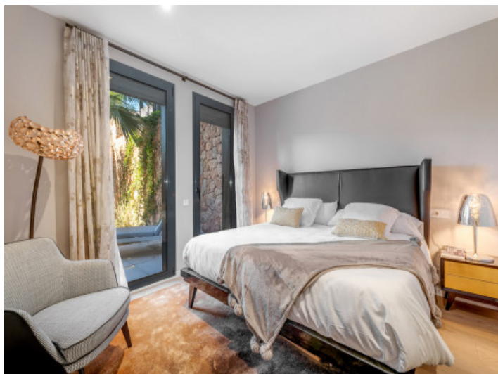
Master bedroom with garden access