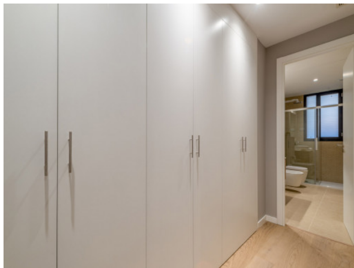
Large dressing area