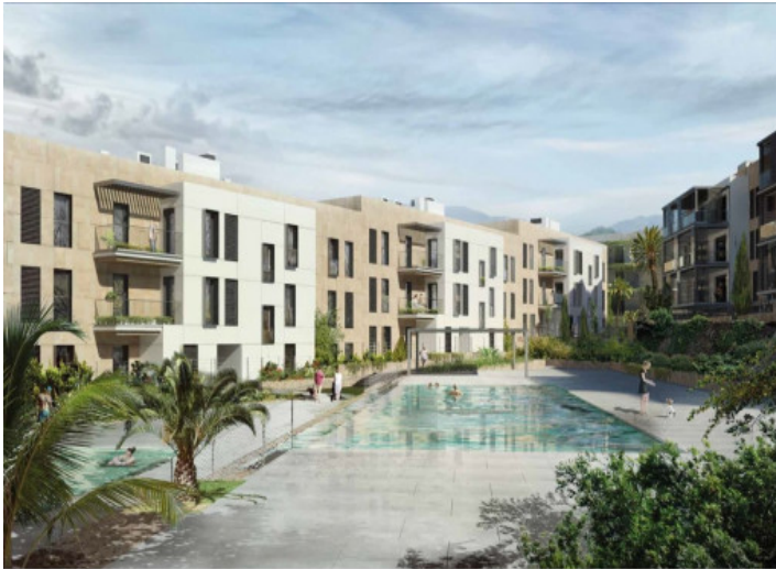
Communal pool area

All information is correct to the best of our knowledge. Errors and prior sale excepted. This prospectus is purely for information purposes. Only the notarized deed of sale is legally binding.