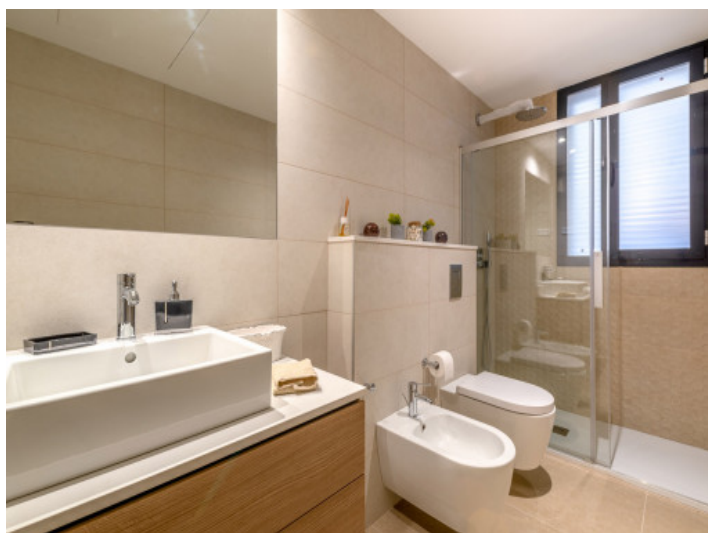
Master bathroom en suite