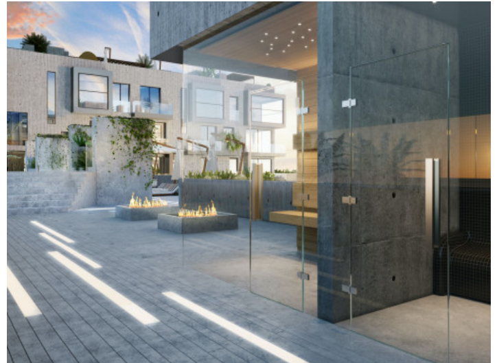
Inviting sauna and fitness area