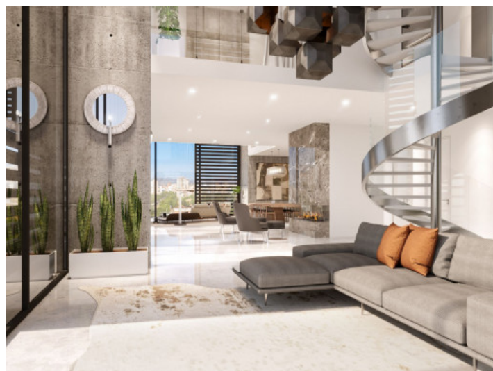
Spacious living area of the duplex penthouse