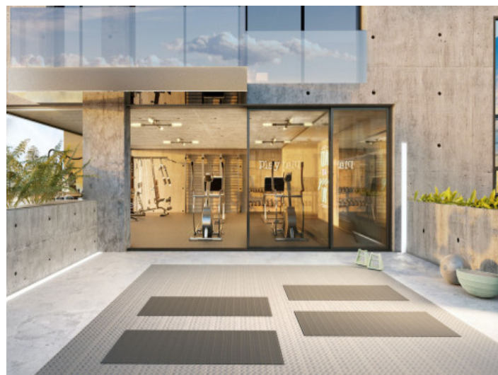
Splendid fitness area

All information is correct to the best of our knowledge. Errors and prior sale excepted. This prospectus is purely for information purposes. Only the notarized deed of sale is legally binding.