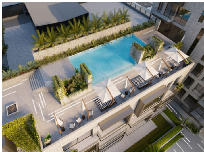
View of the community pool area