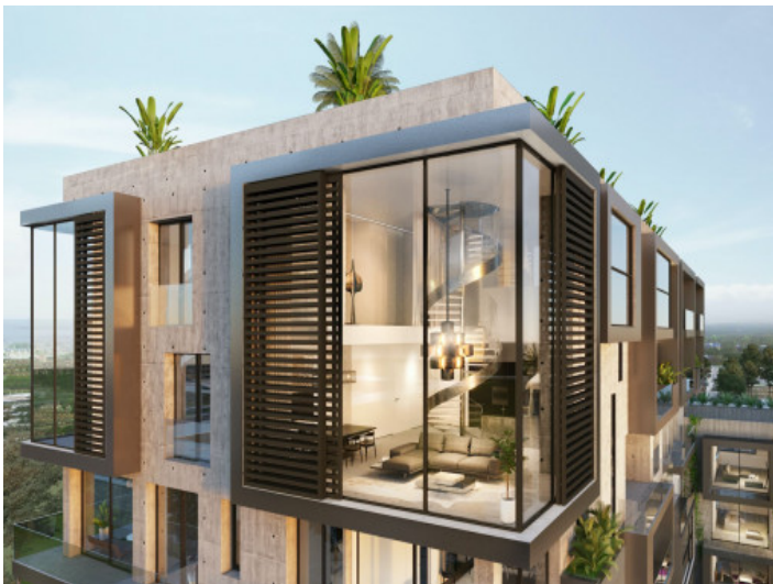
Exterior view of the duplex penthouse