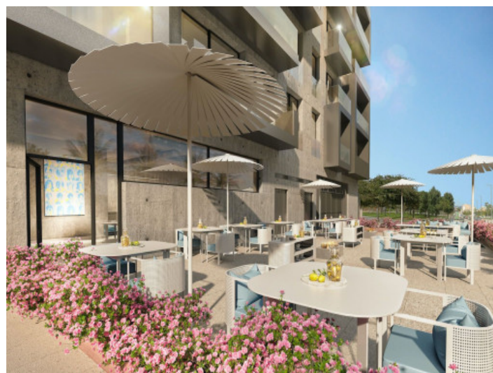
Community restaurant of the complex