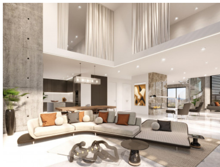
Spacious living area of the duplex penthouse