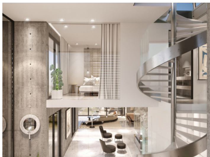
Spacious living area of the duplex penthouse