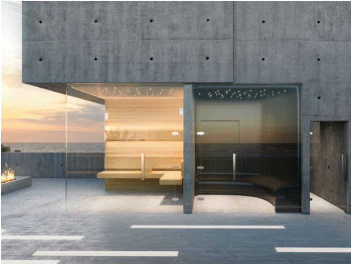
Inviting sauna and fitness area