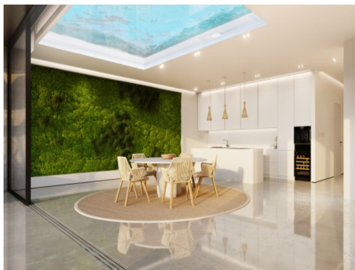
Dining area and kitchen