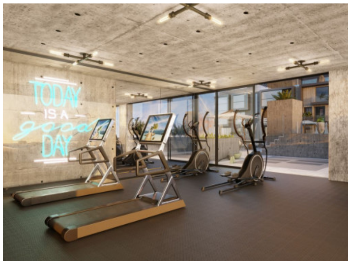
Community area with gym

All information is correct to the best of our knowledge. Errors and prior sale excepted. This prospectus is purely for information purposes. Only the notarized deed of sale is legally binding.