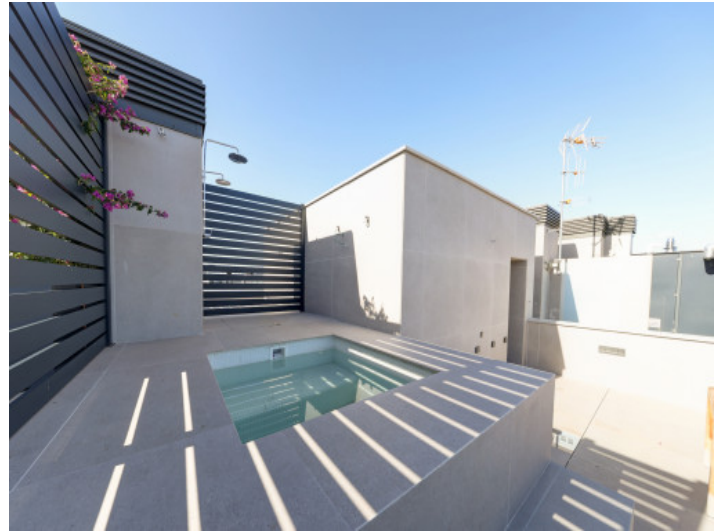
Private terrace with pool