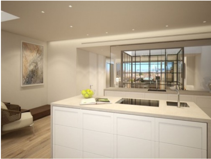
Large kitchen with cooking island