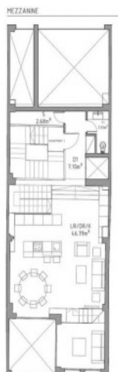
Construction plan of the upper floor