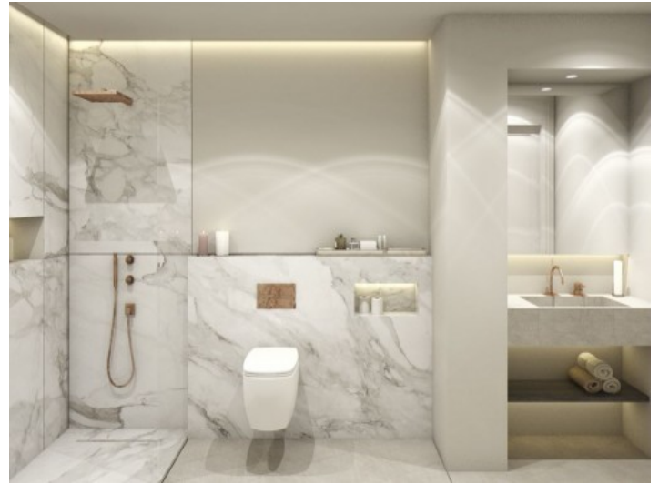
One of 3 luxurious bathrooms