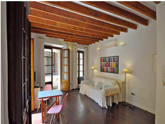
Living area with french balconies