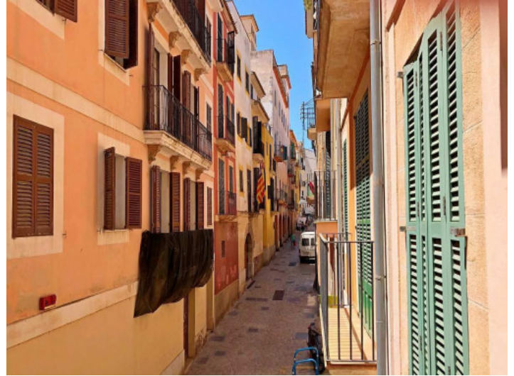
Charming street view