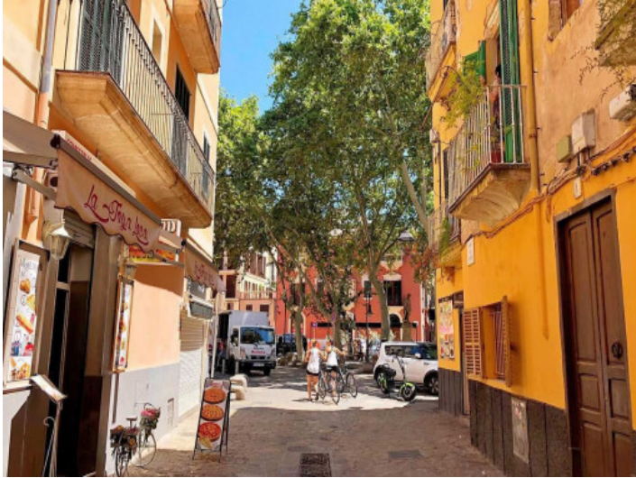
Beautiful apartment in Palma Oldtown