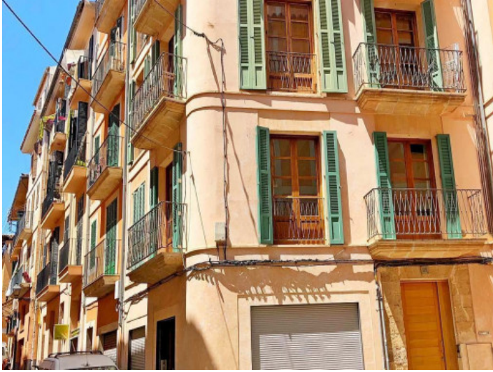
Exterior view of the building

All information is correct to the best of our knowledge. Errors and prior sale excepted. This prospectus is purely for information purposes. Only the notarized deed of sale is legally binding.