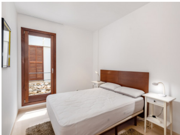
A total of 2 bedrooms