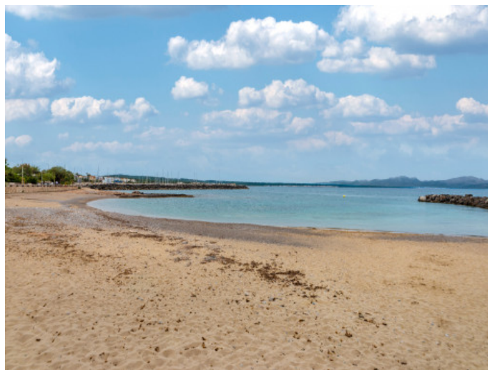
Close to the marina