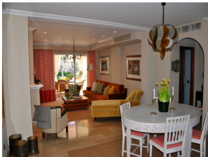
Comfortable living space

All information is correct to the best of our knowledge. Errors and prior sale excepted. This prospectus is purely for information purposes. Only the notarized deed of sale is legally binding.