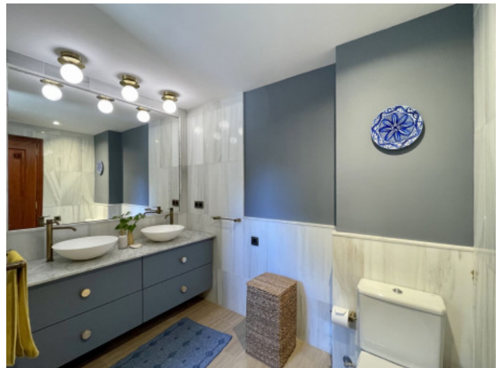
One of the two bathrooms