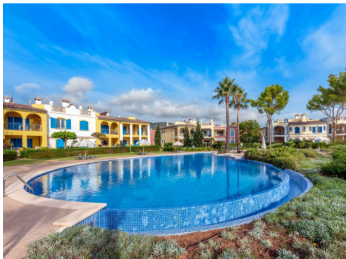
Very well-maintained residential complex in Bendinat