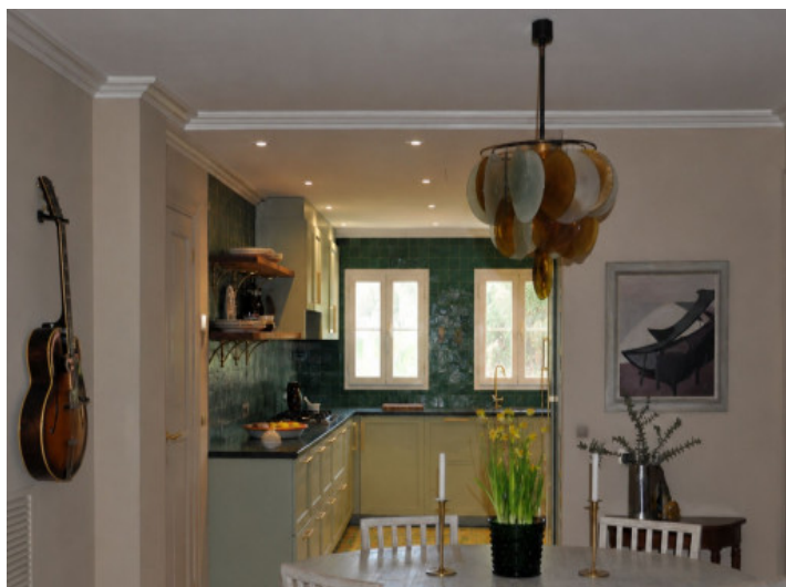
Living area and fully equipped Miele kitchen