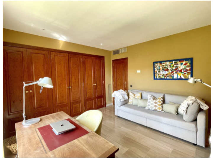
Second bedroom currently used as an office