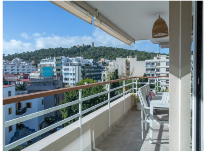
Spacious terrace with view of Bellver castle

All information is correct to the best of our knowledge. Errors and prior sale excepted. This prospectus is purely for information purposes. Only the notarized deed of sale is legally binding.