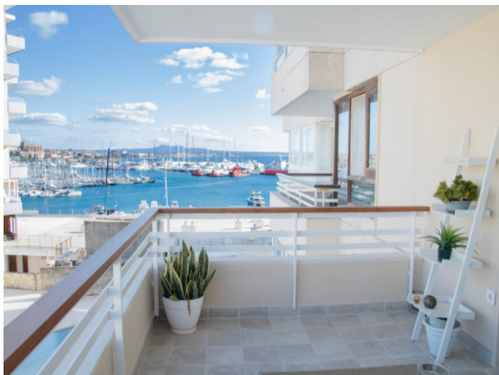
Sea view terrace