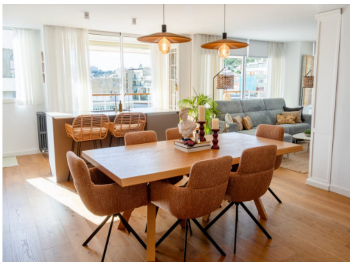
Dining area with open kitchen