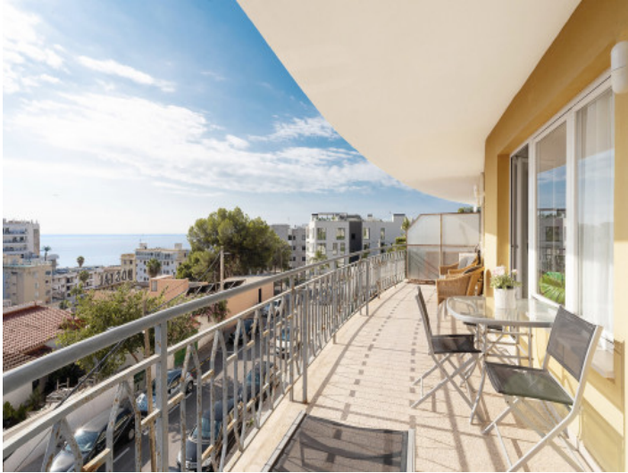
Terrace with sea views