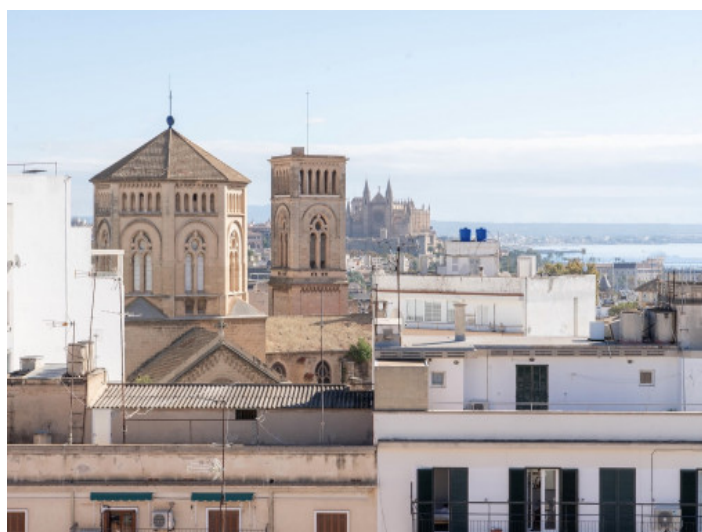
View reaching as far as the cathedral

All information is correct to the best of our knowledge. Errors and prior sale excepted. This prospectus is purely for information purposes. Only the notarized deed of sale is legally binding.