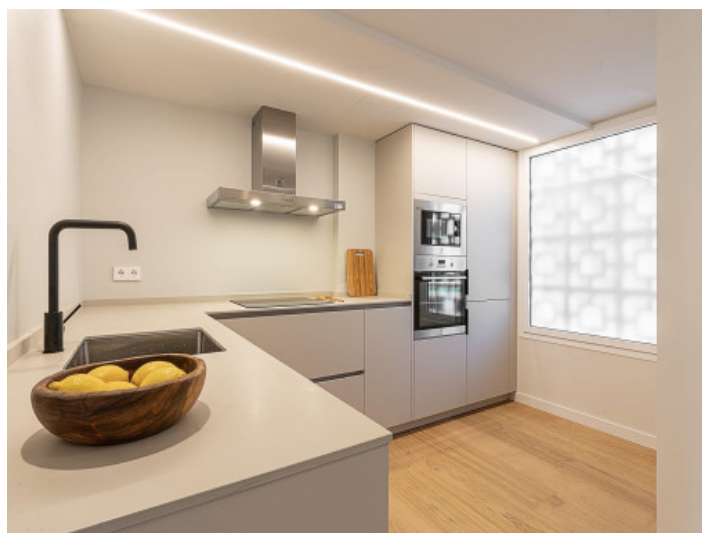
Modern fully equipped fitted kitchen