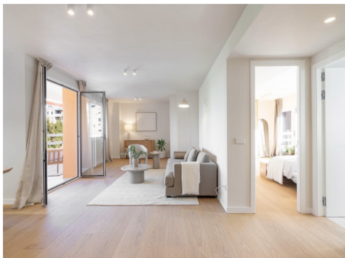
Spacious and open living area