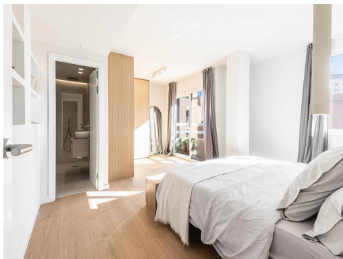
Master bedroom with private terrace

All information is correct to the best of our knowledge. Errors and prior sale excepted. This prospectus is purely for information purposes. Only the notarized deed of sale is legally binding.