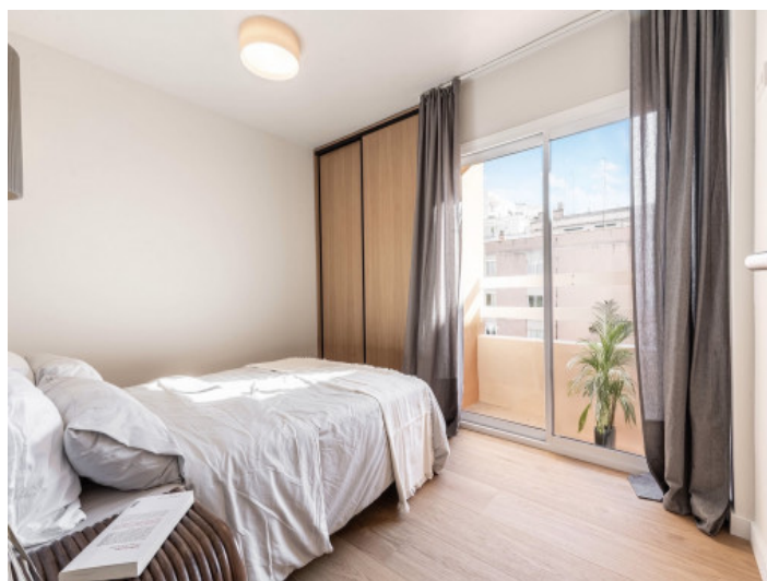
Additional bedroom with private terrace