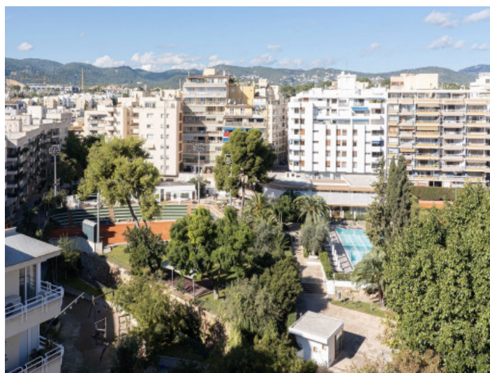
View over the Palma Tennis Club