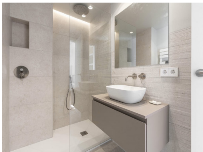
En-suite master bathroom