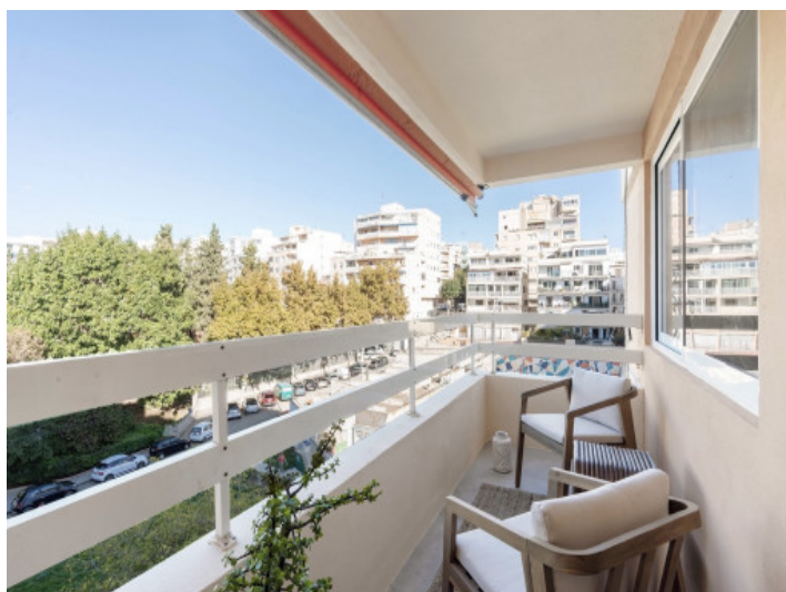
Covered main terrace overlooking the Palma Tennis Club