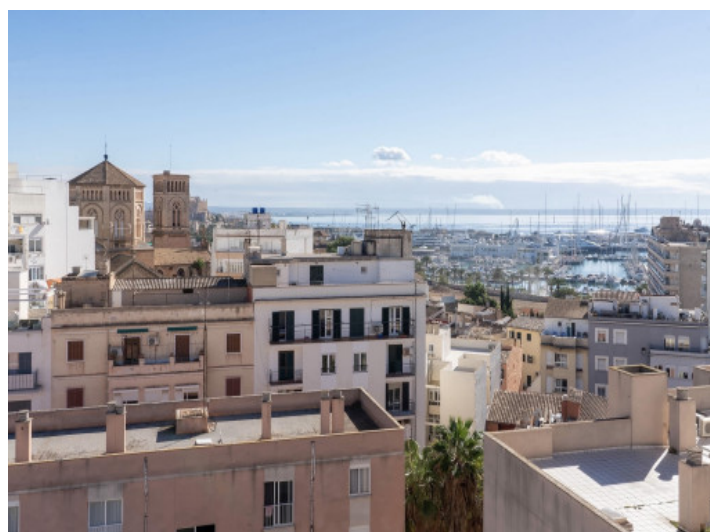
View from the communal terrace of the harbor and the sea