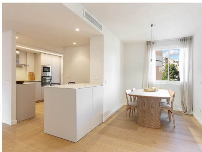
Bright dining area with adjoining open kitchen