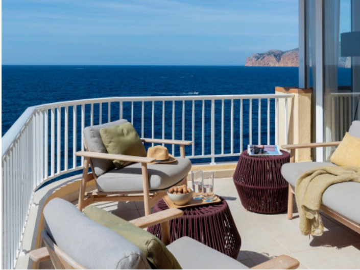
Terrace with stunning sea views