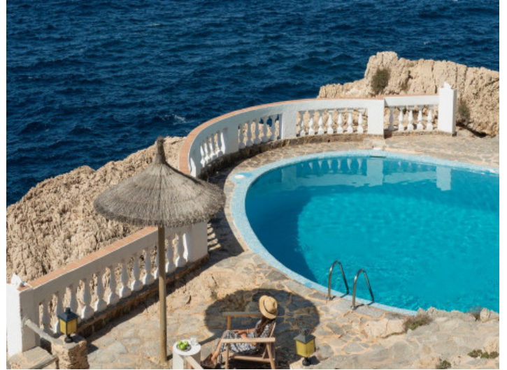
Communal pool right by the sea with panoramic views