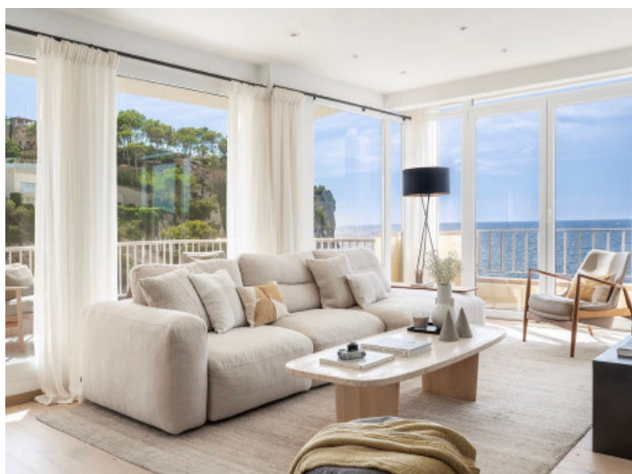
Light-filled living area with sea views