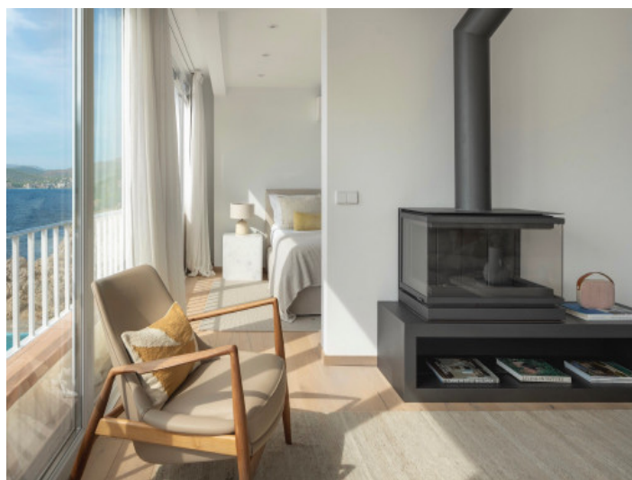
Open-plan living area with a cozy fireplace