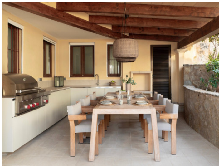
Covered terrace with fully equipped outdoor kitchen