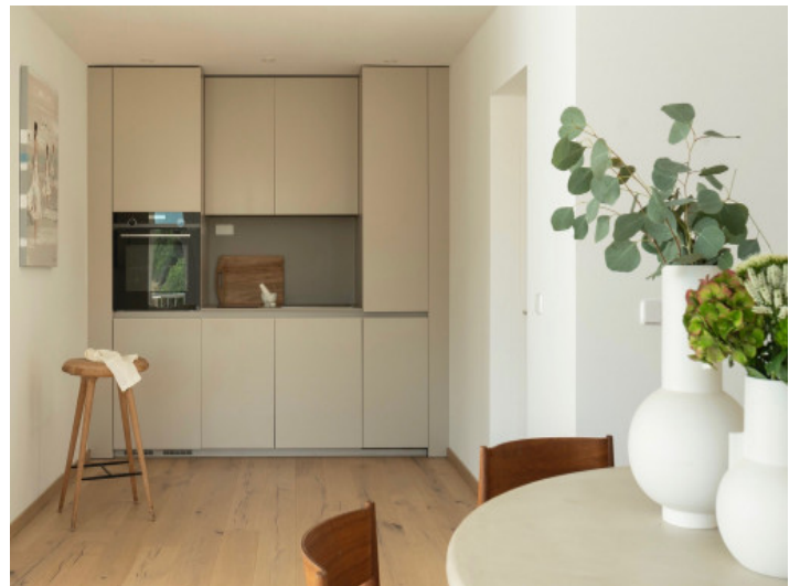
Tastefully furnished kitchen