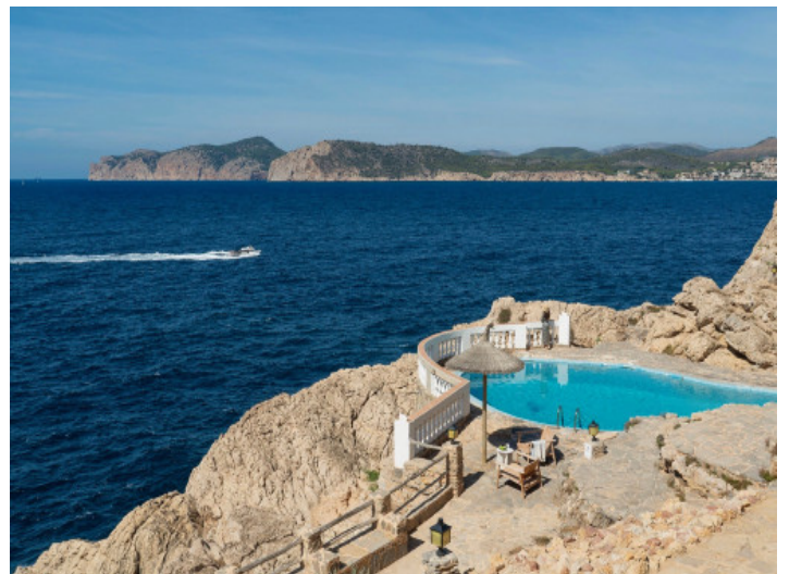
Well-maintained communal complex

All information is correct to the best of our knowledge. Errors and prior sale excepted. This prospectus is purely for information purposes. Only the notarized deed of sale is legally binding.