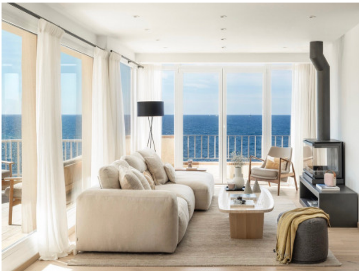
Living area with an impressive view of the Mediterranean Sea