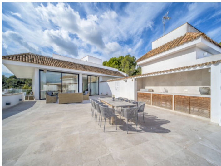
Rooftop with outdoor kitchen