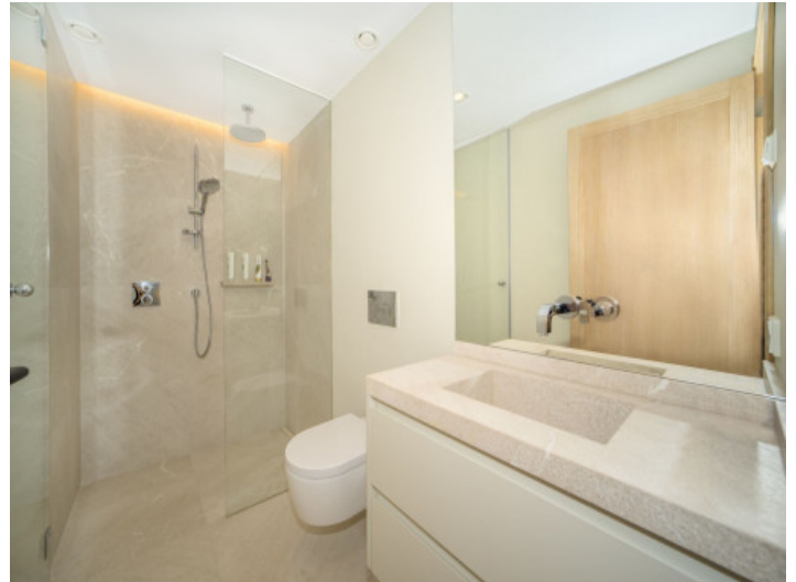
Walk in shower