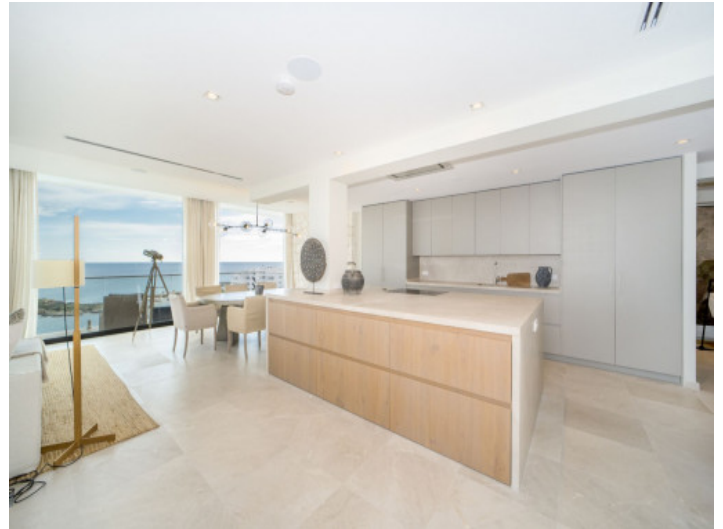
large kitchen island