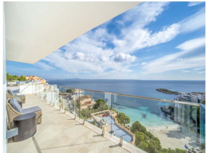
Close to the beach