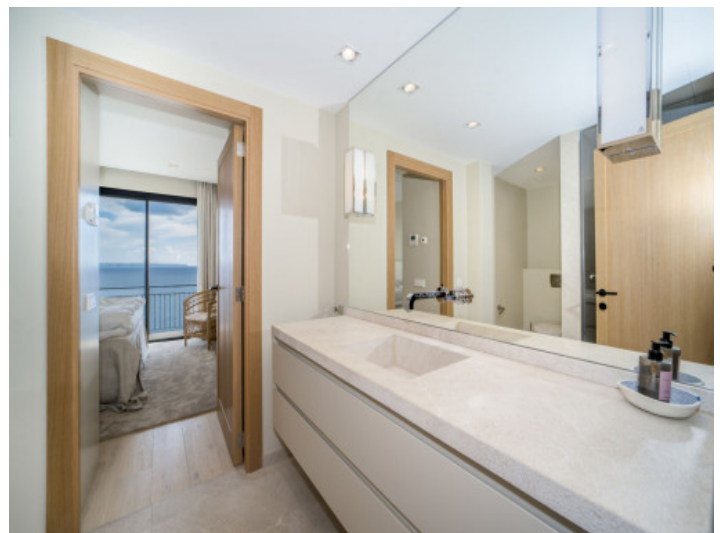
En suite bathroom