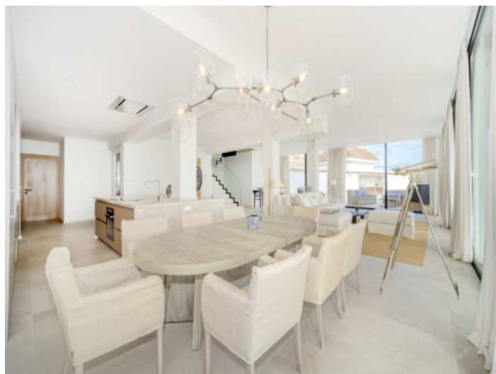
Large dining area

All information is correct to the best of our knowledge. Errors and prior sale excepted. This prospectus is purely for information purposes. Only the notarized deed of sale is legally binding.