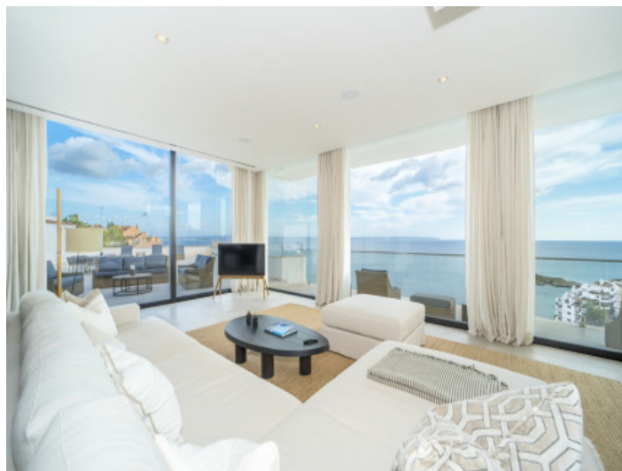
Amazing sea views