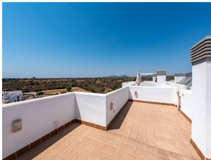
views from the rooftop terrace