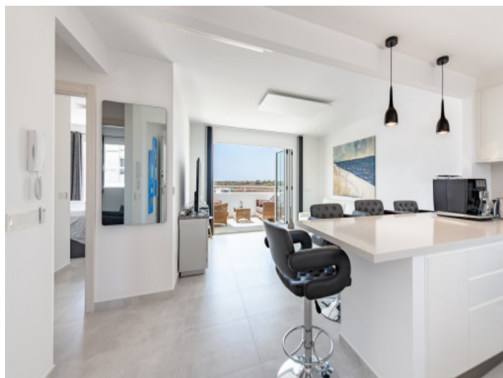
View from the kitchen to the living area

All information is correct to the best of our knowledge. Errors and prior sale excepted. This prospectus is purely for information purposes. Only the notarized deed of sale is legally binding.