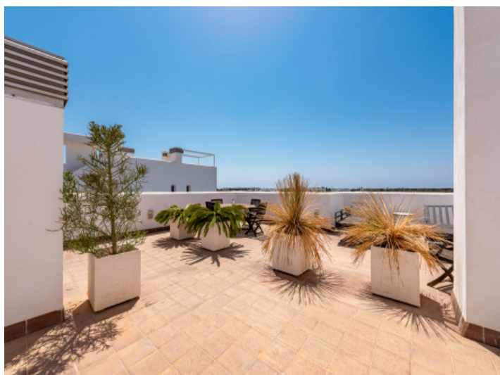
Rooftop dining area