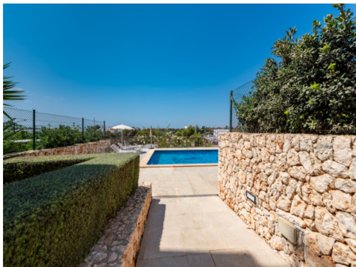
Access to the community pool