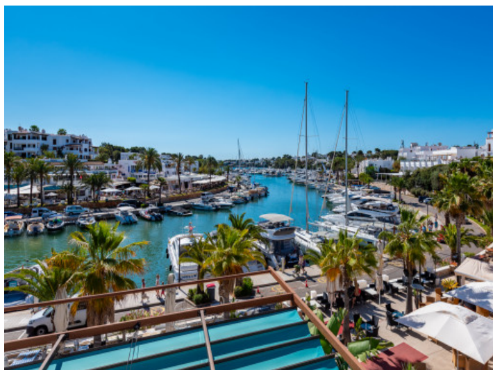
Harbour of Cala D'Or