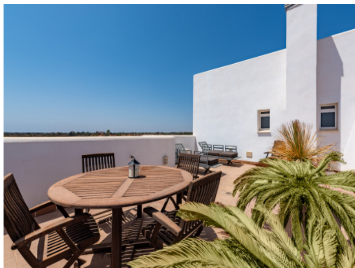
Dining area on the rooftop

All information is correct to the best of our knowledge. Errors and prior sale excepted. This prospectus is purely for information purposes. Only the notarized deed of sale is legally binding.