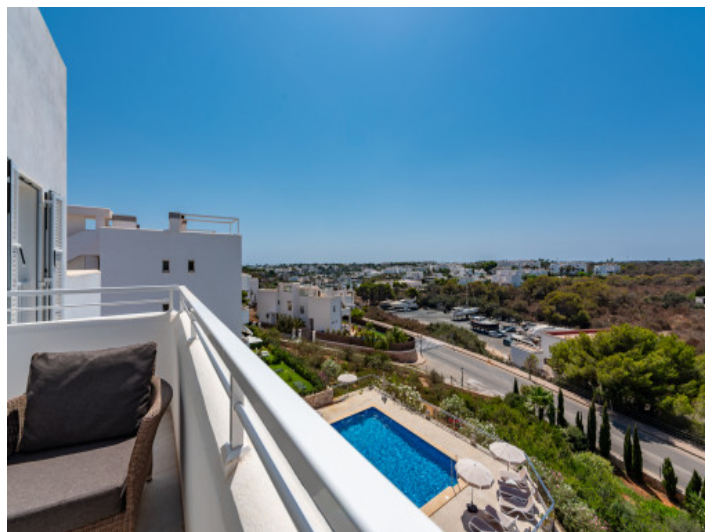
View to the community pool