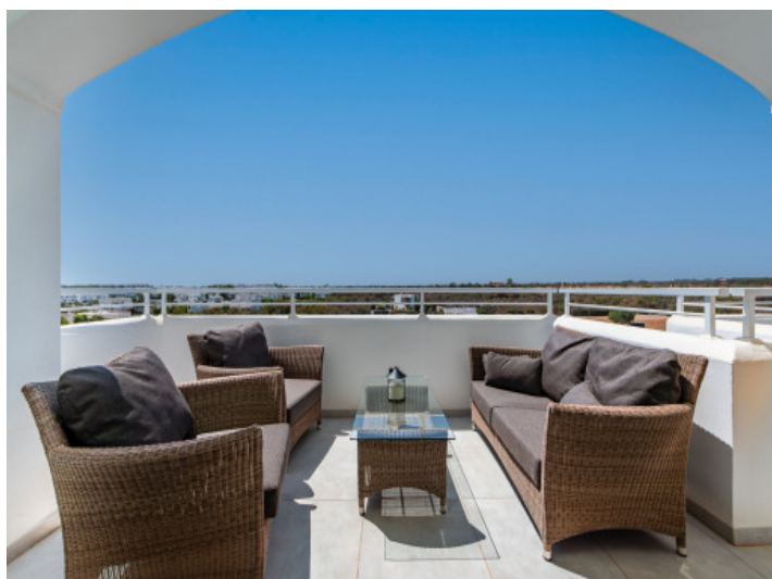
Terrace in front of the living area