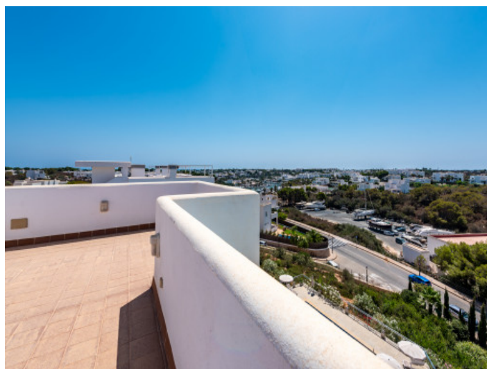
Views up to the harbour