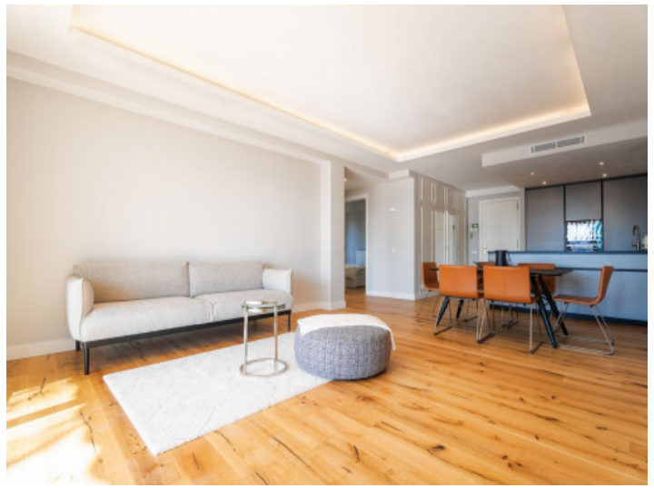
Open room layout