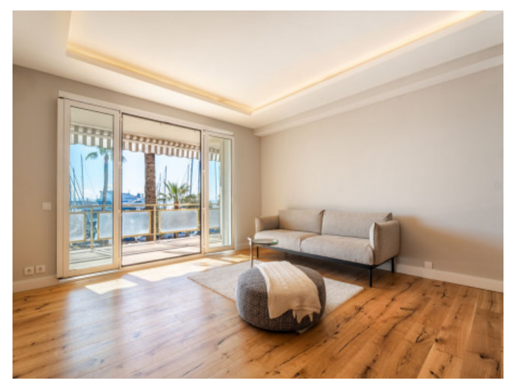
Bright flat in top location