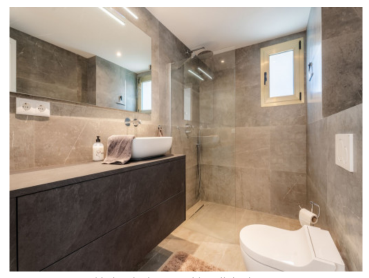
Modern bathroorm with walk-in shower