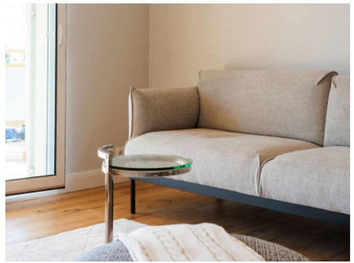
Cozy apartment in top location