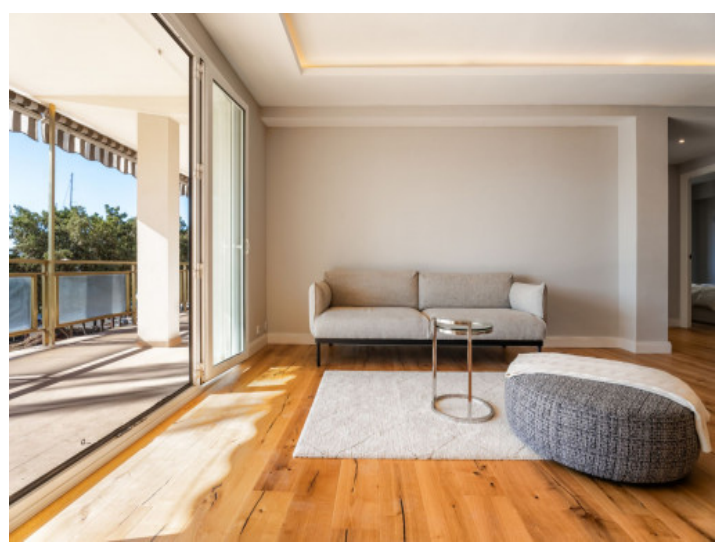
Terrace with harbour views