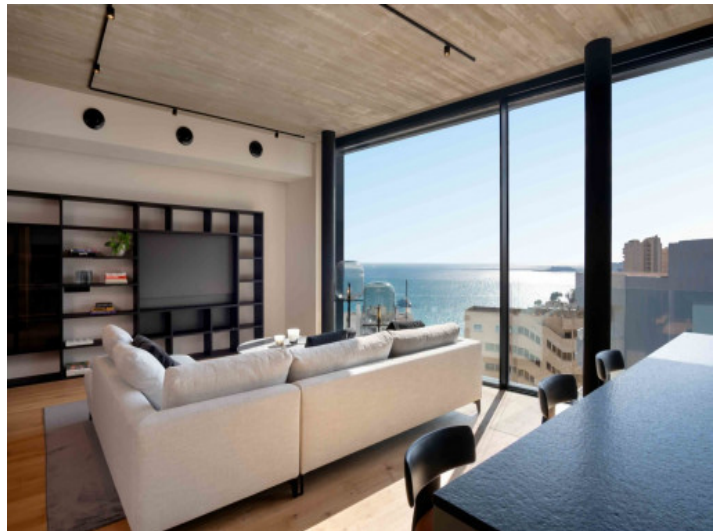
Living area Bright living area All information is correct to the best of our knowledge. Errors and prior sale excepted. This prospectus is purely for information purposes. Only the notarized deed of sale is legally binding.

PORTA MALLORQUINA • THERESIENSTR.: 81, 80333 MUNICH TEL. +34 971 698 242 • INFO@PORTAMALLORQUINA.COM