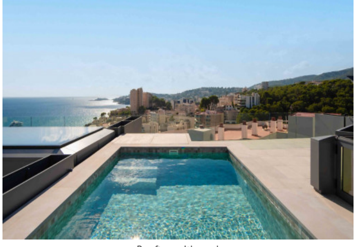
Rooftop with pool