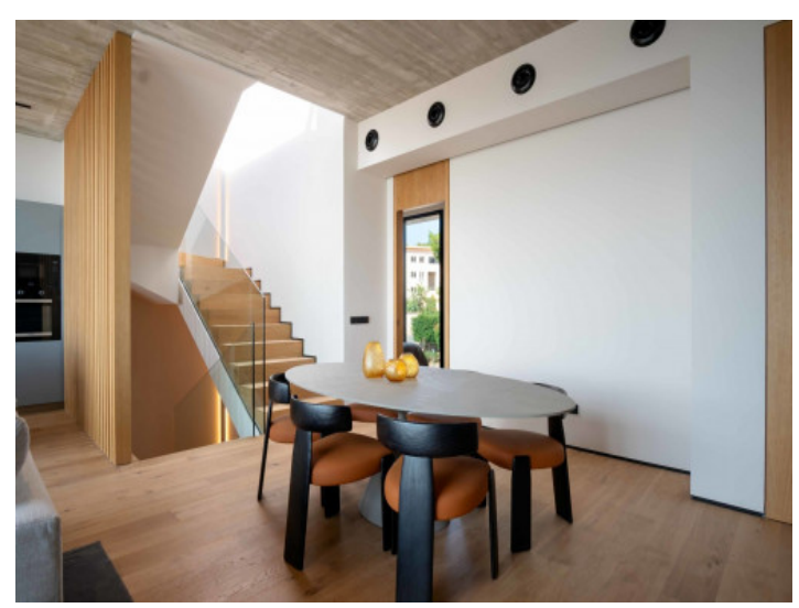
Open room layout