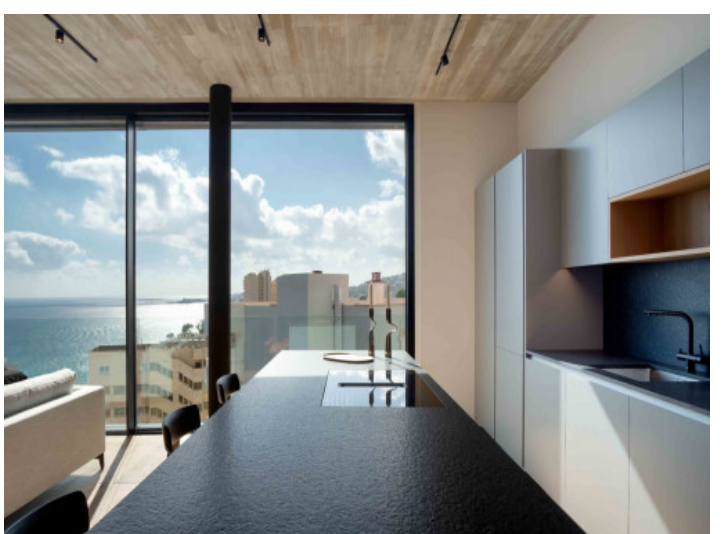
Views from the kitchen Bedroom with bathroom en suite All information is correct to the best of our knowledge. Errors and prior sale excepted. This prospectus is purely for information purposes. Only the notarized deed of sale is legally binding.

PORTA MALLORQUINA • THERESIENSTR.: 81, 80333 MUNICH TEL. +34 971 698 242 • INFO@PORTAMALLORQUINA.COM