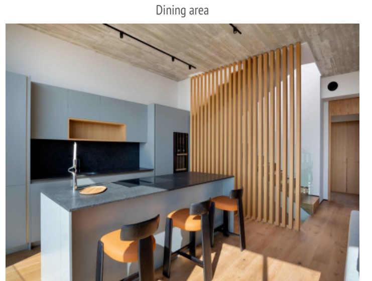
Large kitchen island