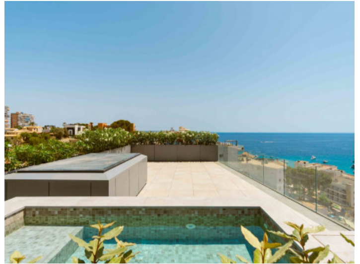
Rooftop terrace with pool