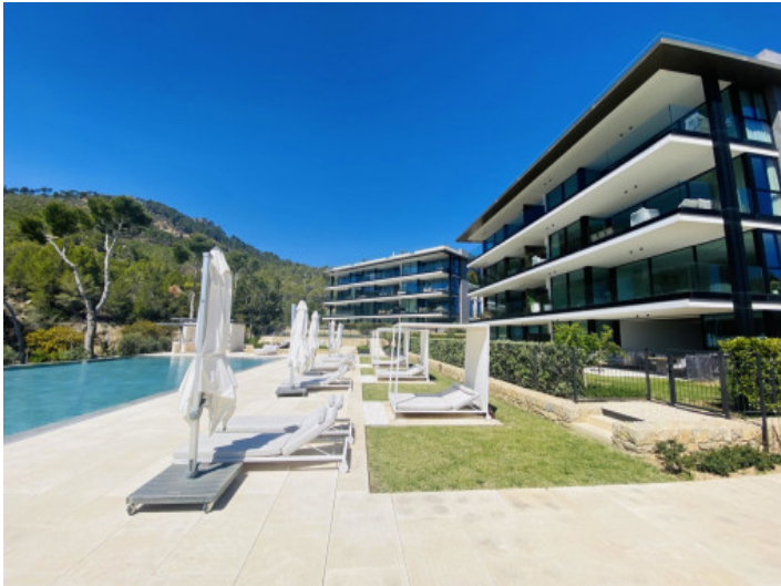
Community pool and garden