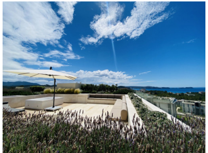
Rooftop terrace with views