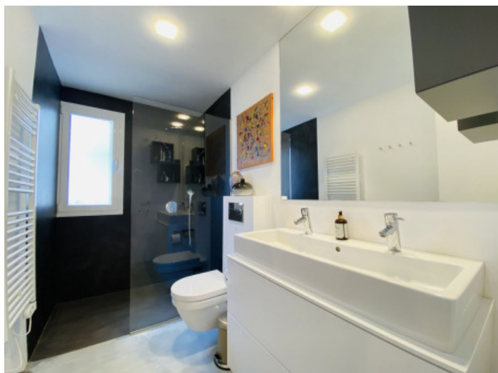
Bathroom ens uite