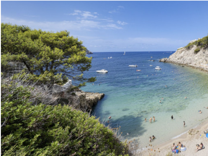
Not far away from the beach

All information is correct to the best of our knowledge. Errors and prior sale excepted. This prospectus is purely for information purposes. Only the notarized deed of sale is legally binding.