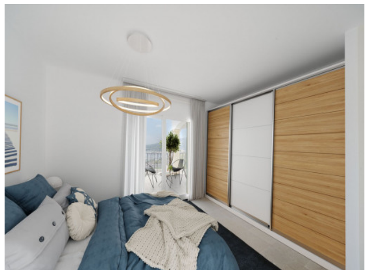
The 3rd bedroom

All information is correct to the best of our knowledge. Errors and prior sale excepted. This prospectus is purely for information purposes. Only the notarized deed of sale is legally binding.