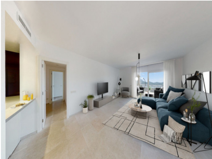
Living area with seaviews