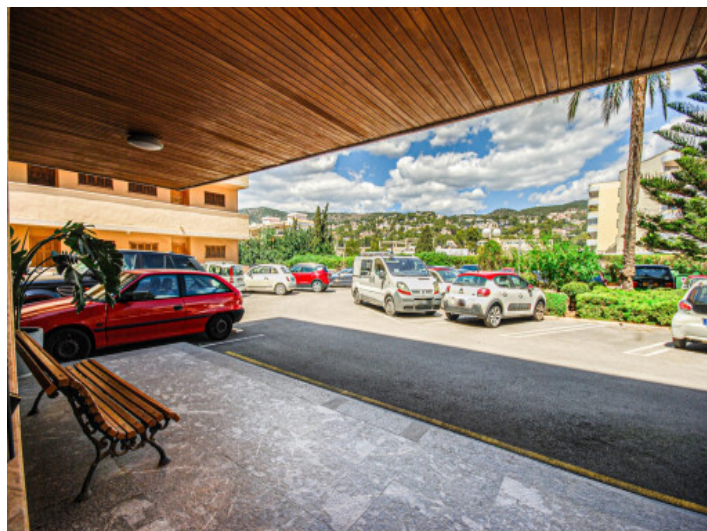
Private parking area