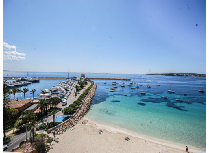
Frontal sea views