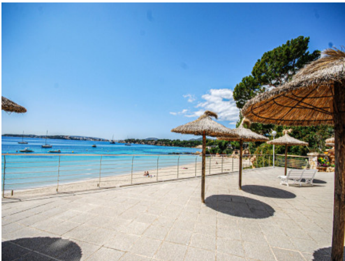
Community pool area