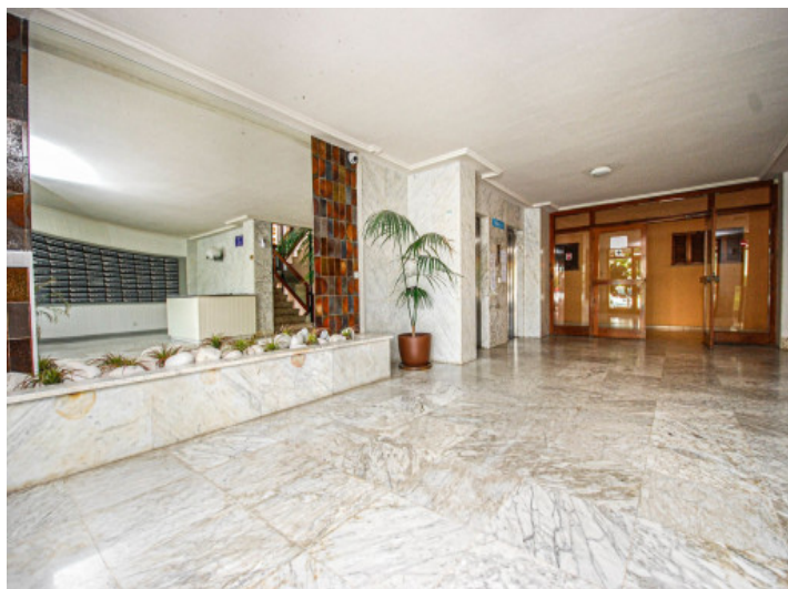
Entrance hall of the building