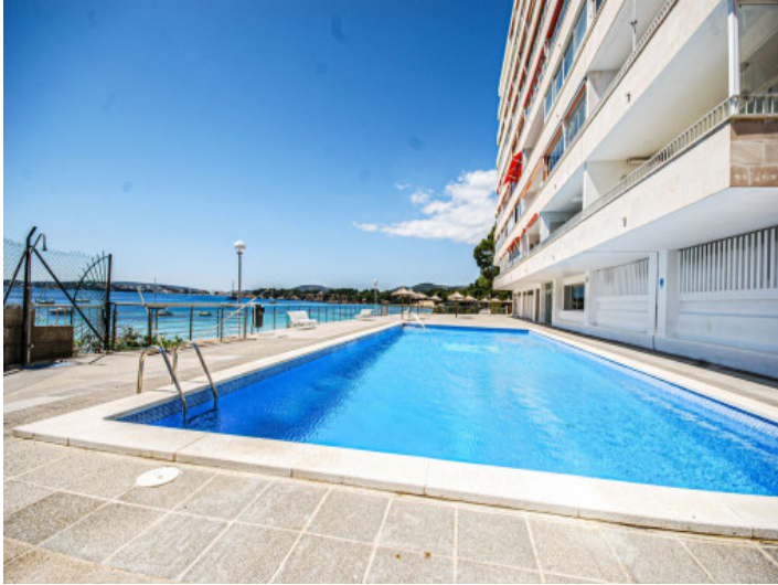
Community pool and facade