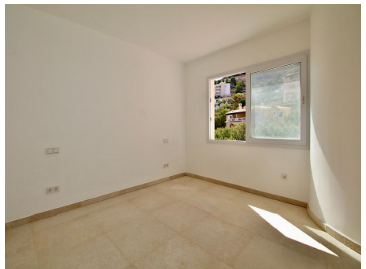
Natural stone floors and undfloor heating in the whole flat