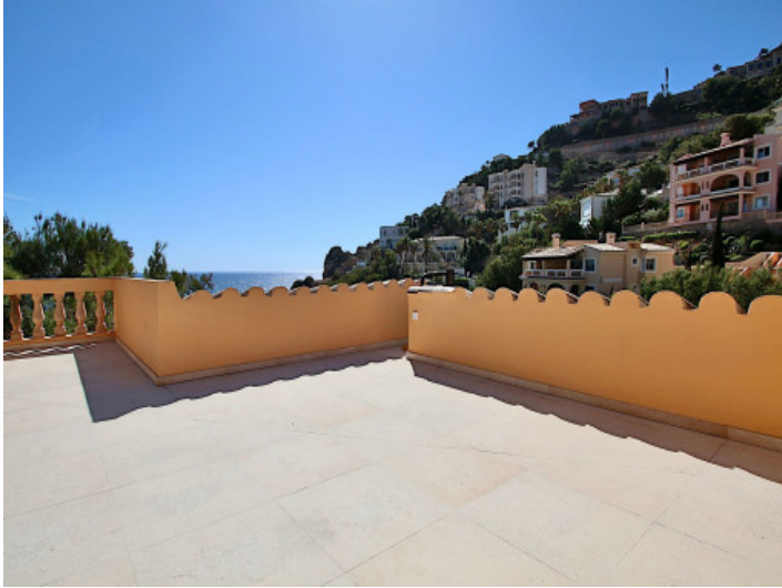
Rooftop terrace with amazing views