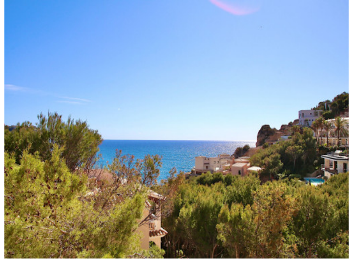
The penthouse is close to the harbour and its restaurants