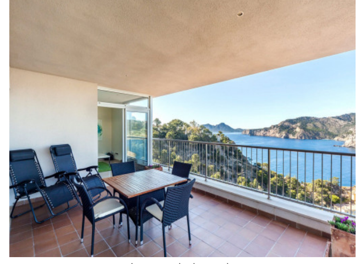
Large porched veranda