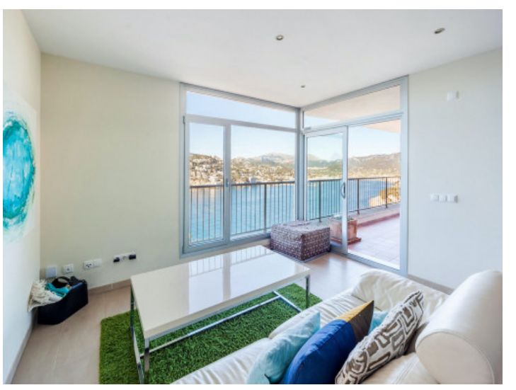
Bright living area