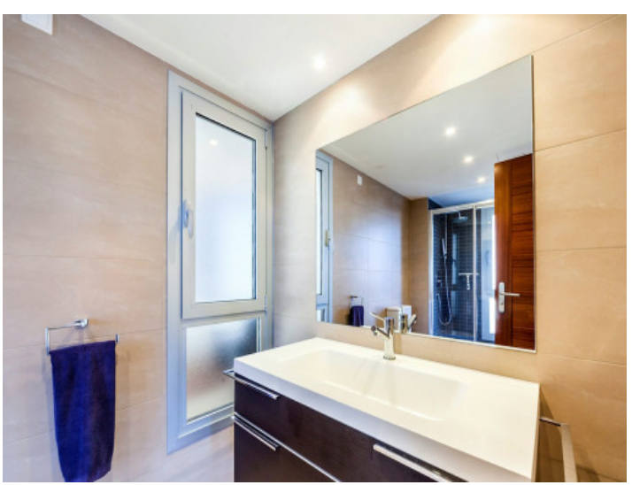
Modern bathroom en suite