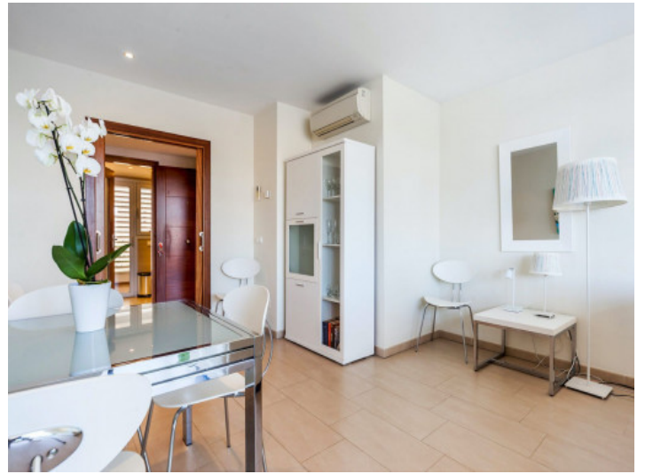
Open dining and living area Fully equipped kitchen All information is correct to the best of our knowledge. Errors and prior sale excepted. This prospectus is purely for information purposes. Only the notarized deed of sale is legally binding.

PORTA MALLORQUINA • C./ CONQUISTADOR 8, 07001 PALMA TEL. +34 971 698 242 • INFO@PORTAMALLORQUINA.COM