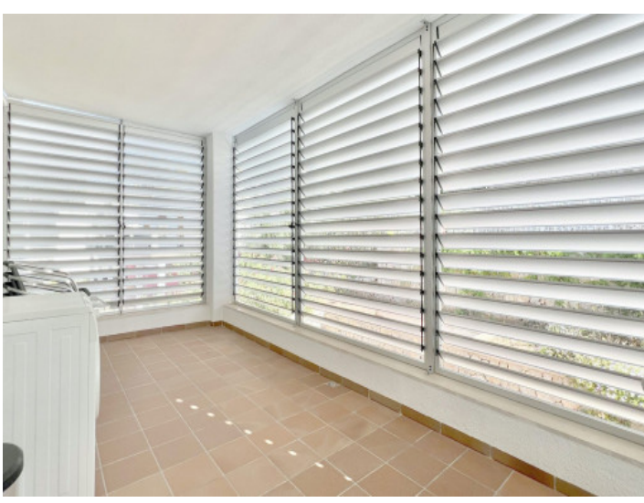
Utility room All information is correct to the best of our knowledge. Errors and prior sale excepted. This prospectus is purely for information purposes. Only the notarized deed of sale is legally binding.

PORTA MALLORQUINA • C./ CONQUISTADOR 8, 07001 PALMA TEL. +34 971 698 242 • INFO@PORTAMALLORQUINA.COM