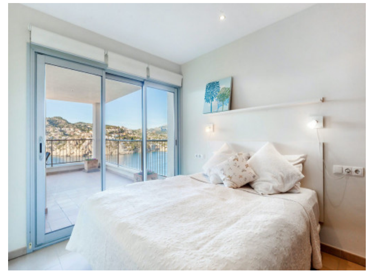
Large bedroom with en suite bathroom