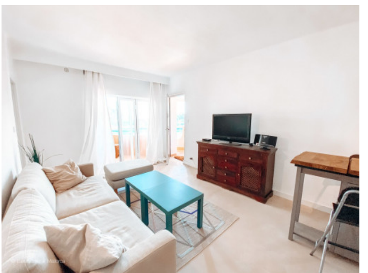
Living area Living area All information is correct to the best of our knowledge. Errors and prior sale excepted. This prospectus is purely for information purposes. Only the notarized deed of sale is legally binding.

PORTA MALLORQUINA • THERESIENSTR.: 81, 80333 MUNICH TEL. +34 971 698 242 • INFO@PORTAMALLORQUINA.COM