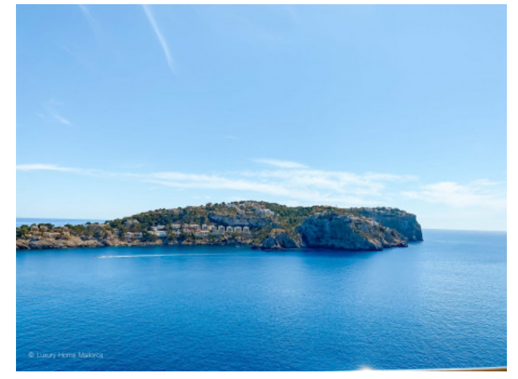
Panorama sea views

PORTA MALLORQUINA® Your home. Our passion.