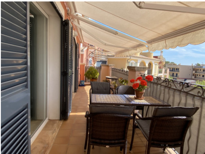
Balcony with sitting area