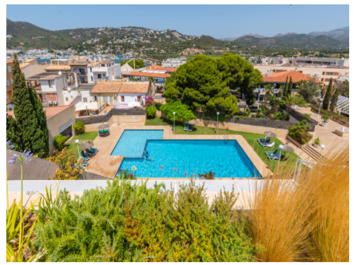
Views from the terrace to the community pool area