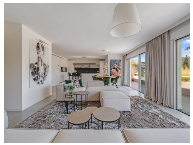
Elegant living concept