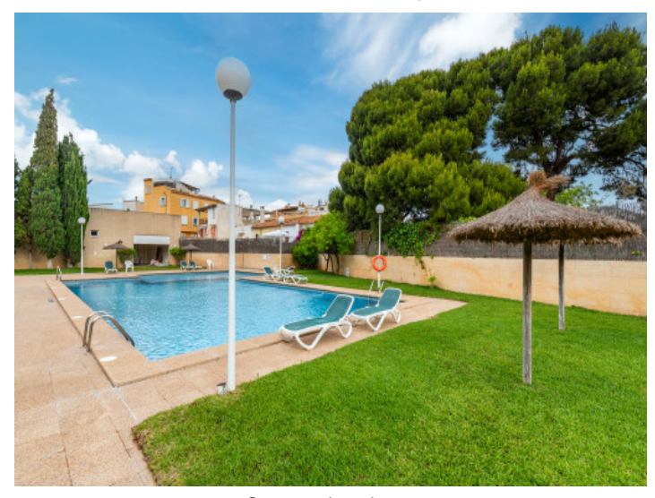
Communal pool area