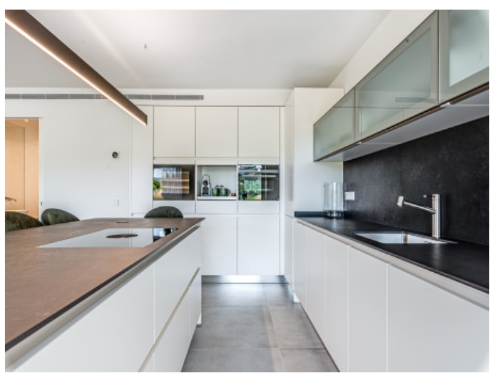
High quality kitchen