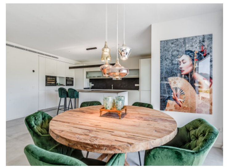
Modern dining area