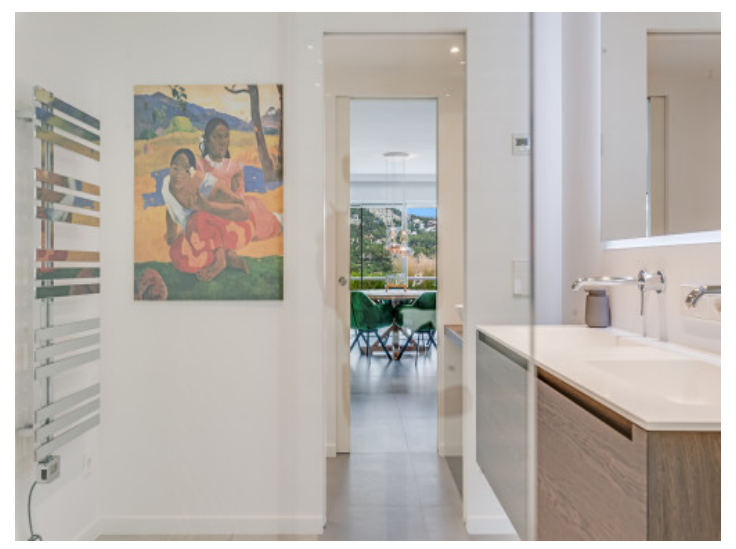
Bathroom with towel heater