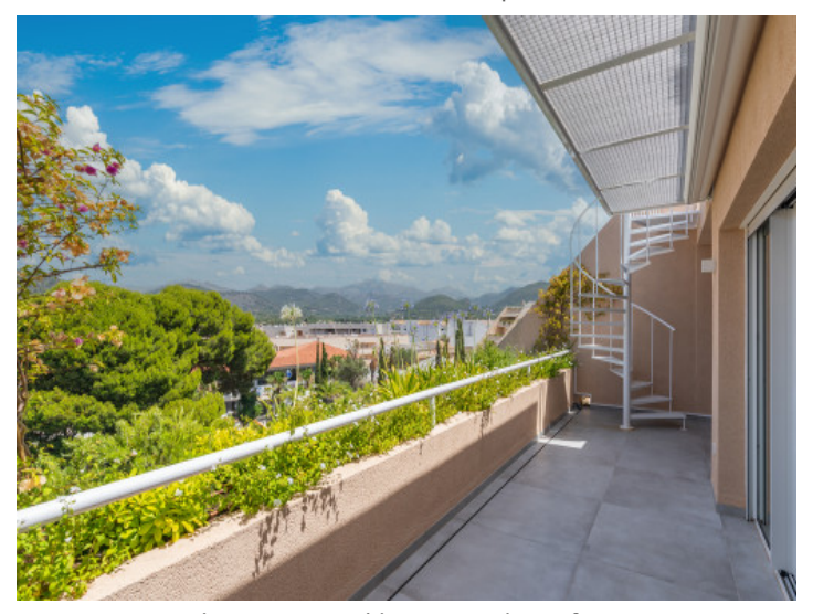
Lower terrace with access to the rooftop