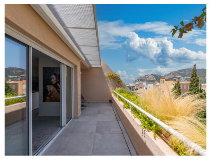
Terrace with fantastic landscape views