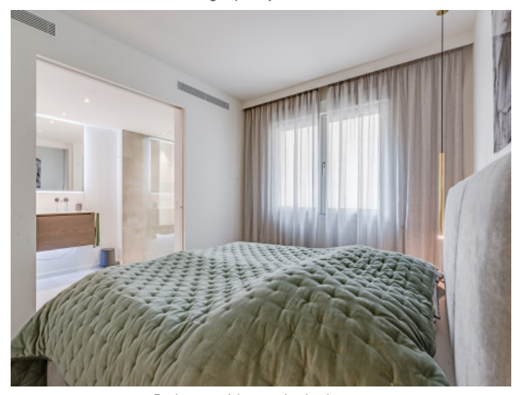
Bedroom with en suite bathroom