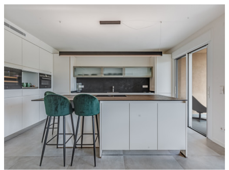
Open kitchen with bar