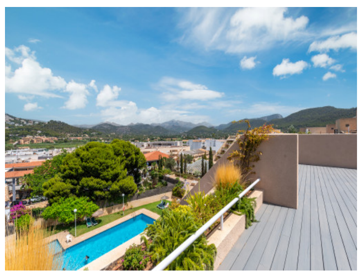
View to the communal pool