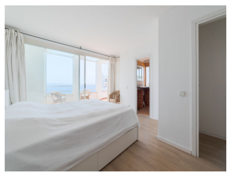
Bedroom with sea view terrace