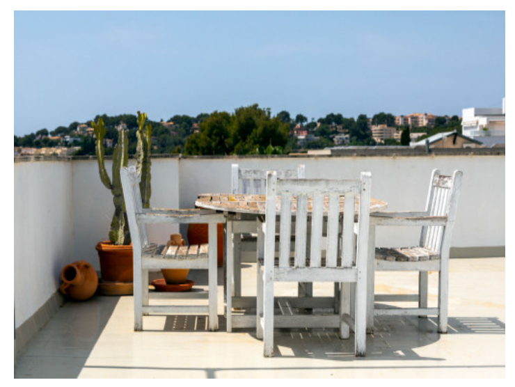
Further terrace with outdoor dining area