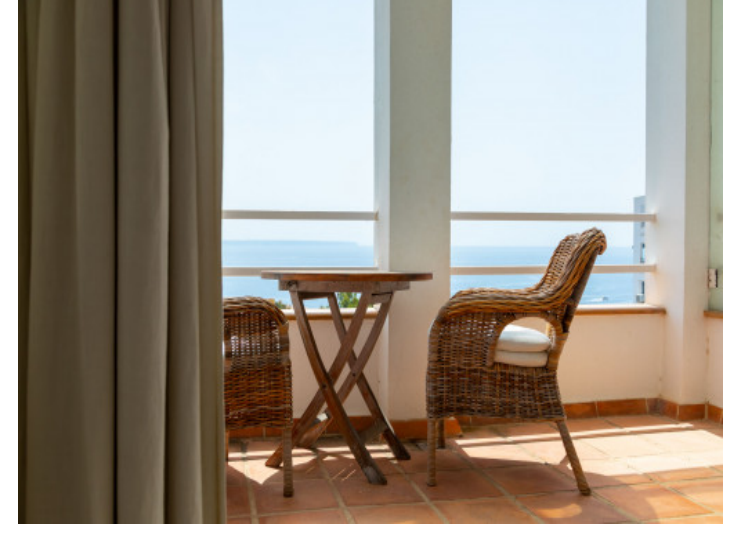
Wintergarden-like sea view terrace

All information is correct to the best of our knowledge. Errors and prior sale excepted. This prospectus is purely for information purposes. Only the notarized deed of sale is legally binding.