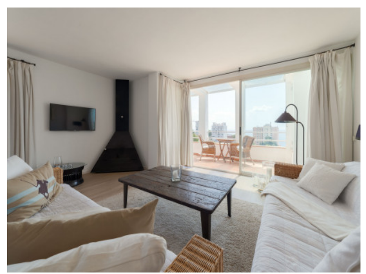
Living area with fireplace