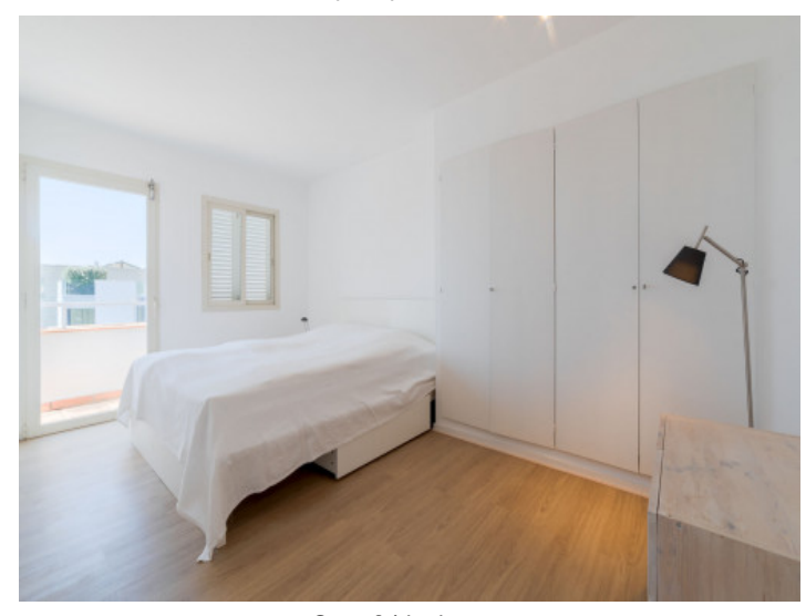
One of 4 bedrooms