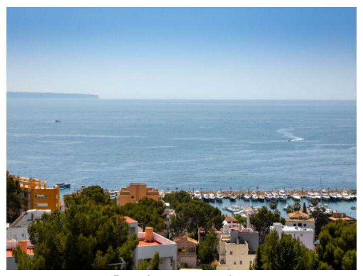
Fantastic panorama sea views