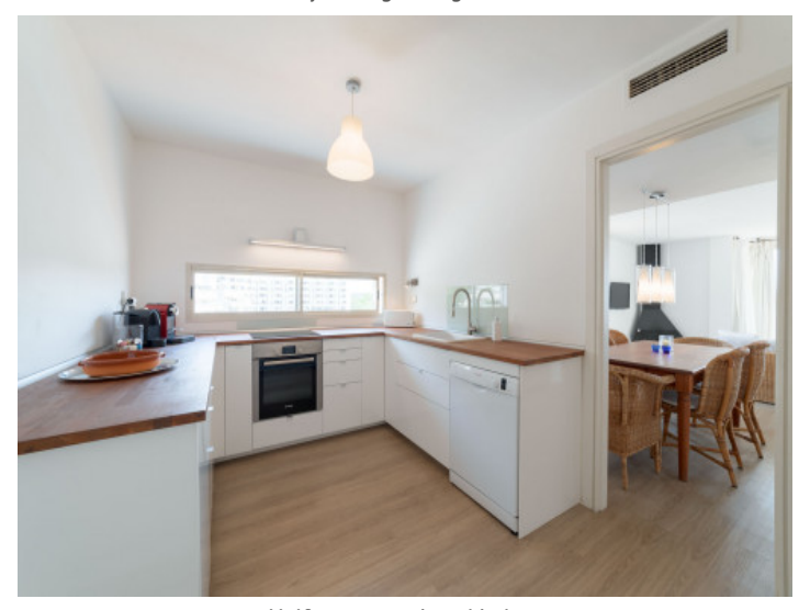
Half-open spacious kitchen