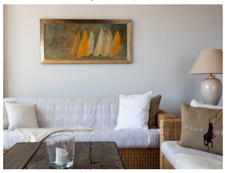
Comfortbale living area