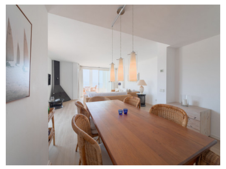
Ajdoining dining area