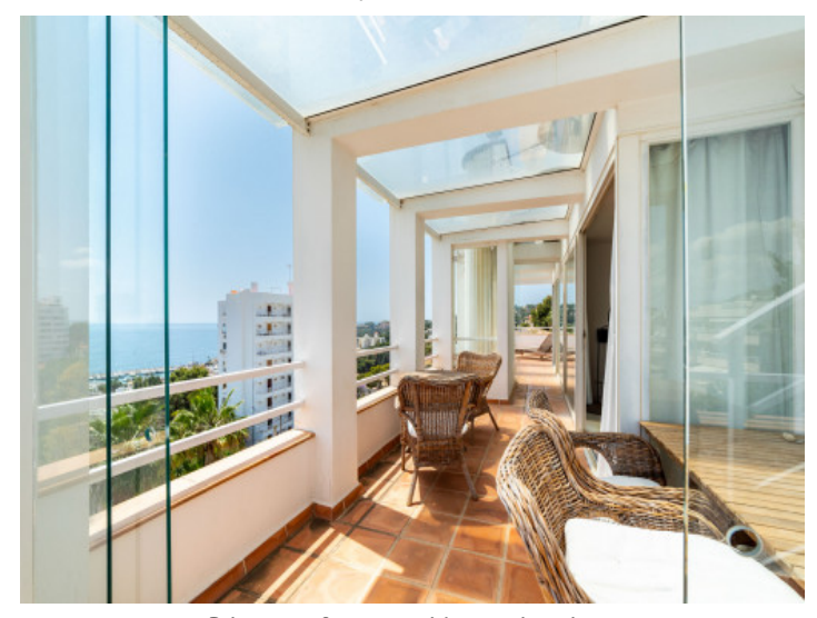
Private roof terrace with stunning views