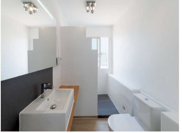
One of 3 bathrooms

All information is correct to the best of our knowledge. Errors and prior sale excepted. This prospectus is purely for information purposes. Only the notarized deed of sale is legally binding.