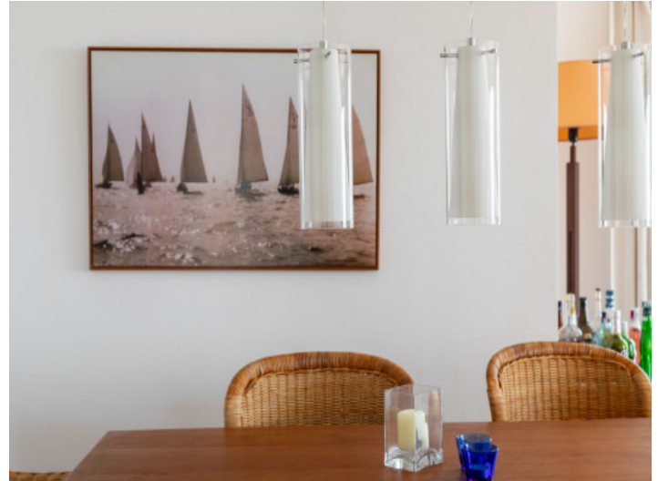
Beautiful dining area