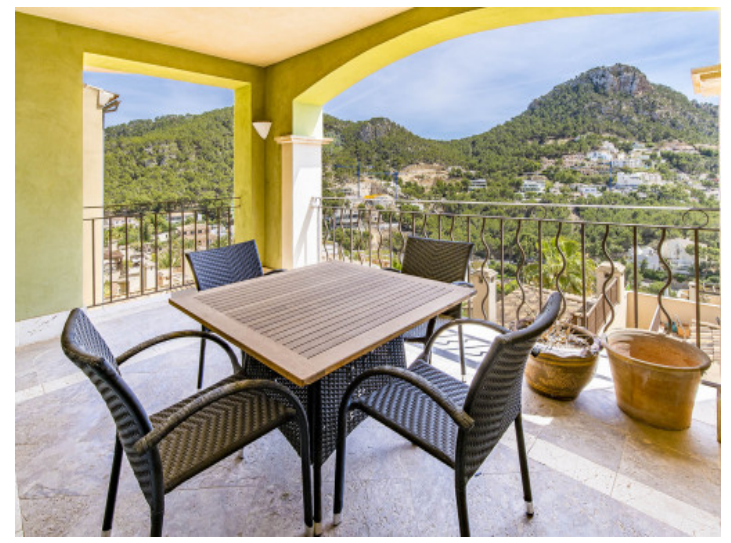
Beautiful outdoor dining area