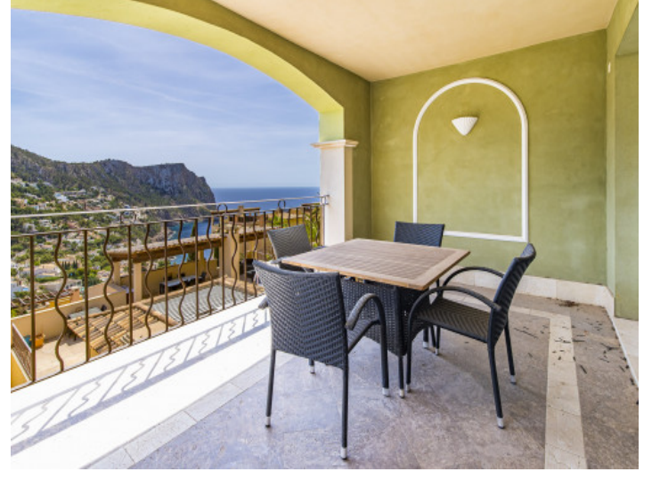
Covered sea view terrace