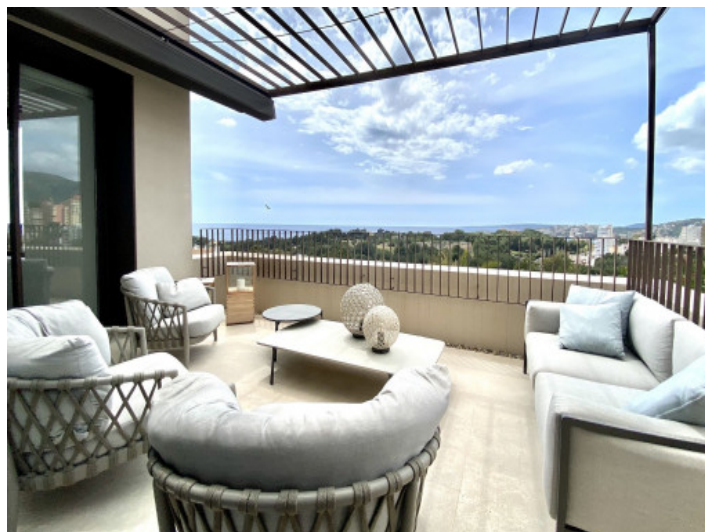
Balcony with sitting area