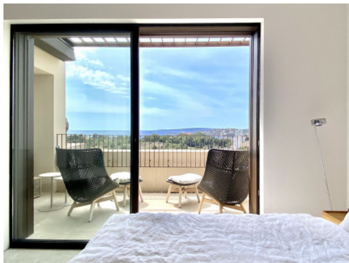
View to the balcony