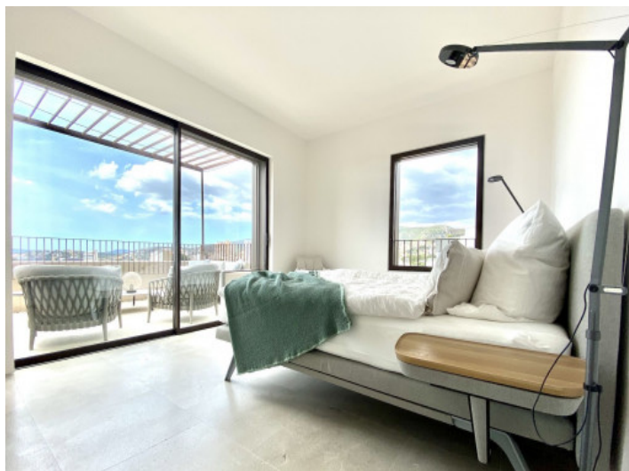
Light flooded bedroom