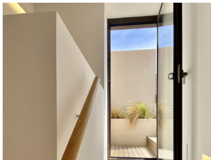
Access to the roof terrace