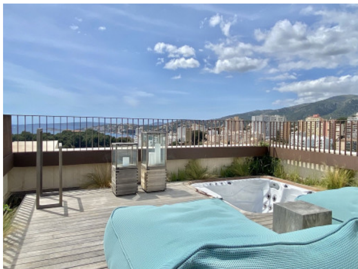
View to the sea