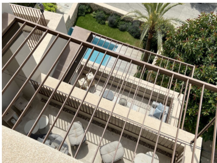
View to the pool