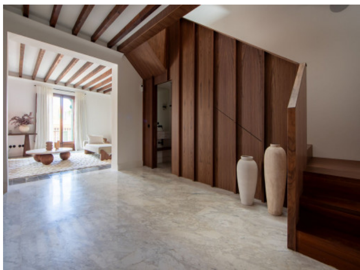
Staircase and hallway