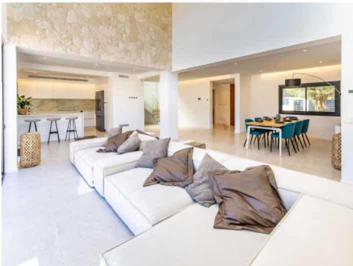
Large living area