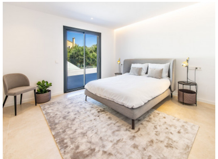
One of 6 bedrooms

All information is correct to the best of our knowledge. Errors and prior sale excepted. This prospectus is purely for information purposes. Only the notarized deed of sale is legally binding.