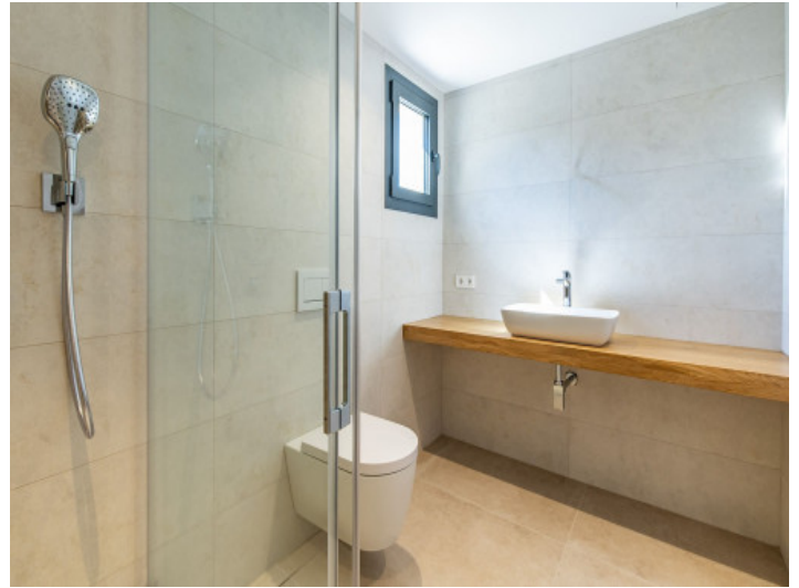
One of 6 bathrooms