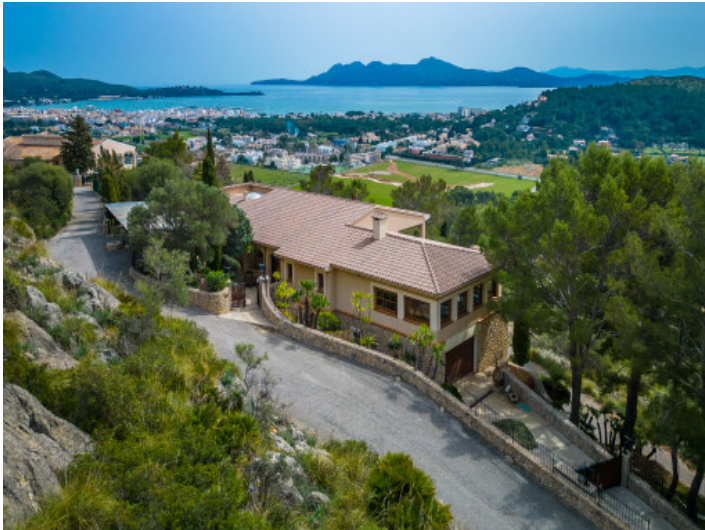
Stunning sea views