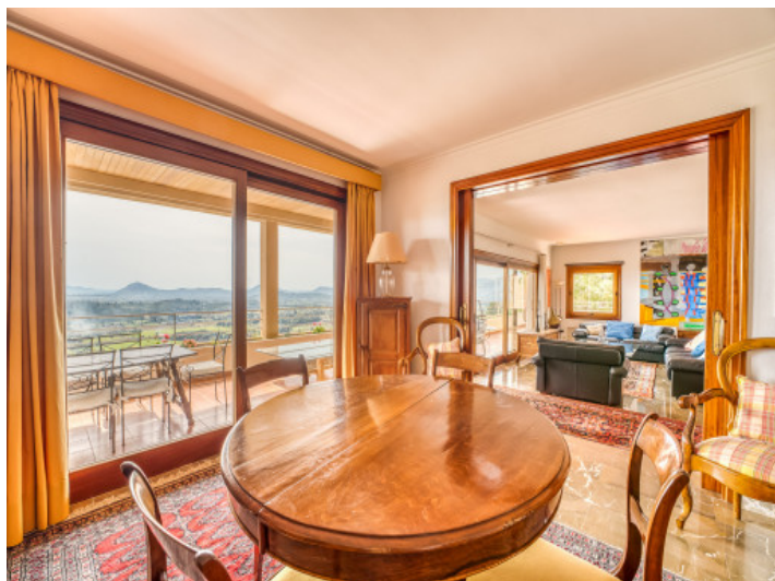
Dining area with sea views