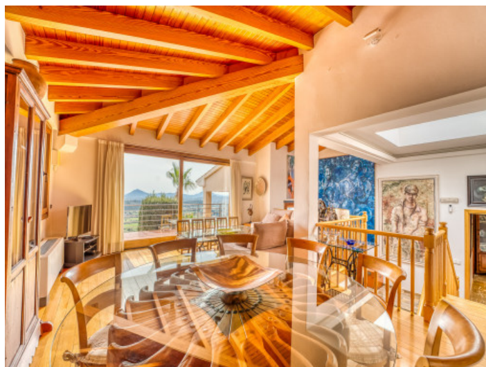
Living and dining area on the upper floor

All information is correct to the best of our knowledge. Errors and prior sale excepted. This prospectus is purely for information purposes. Only the notarized deed of sale is legally binding.