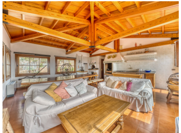
Open plan design on the rooftop floor