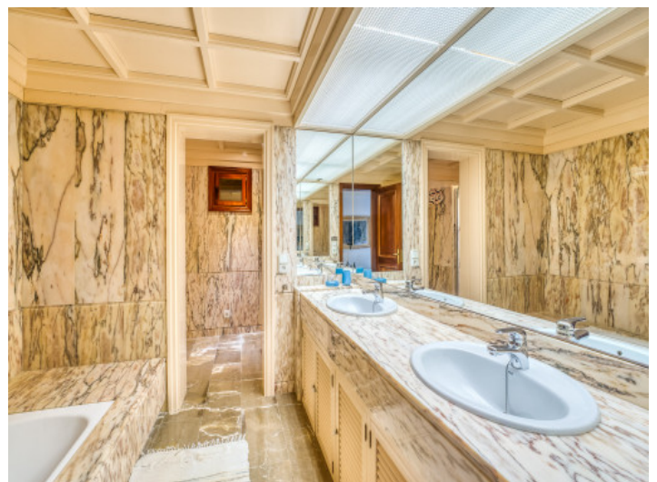
On eof 4 bathrooms

All information is correct to the best of our knowledge. Errors and prior sale excepted. This prospectus is purely for information purposes. Only the notarized deed of sale is legally binding.