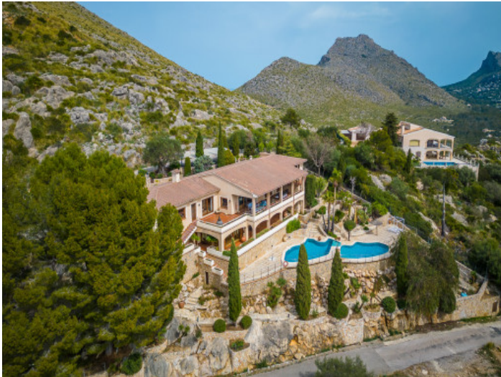
View to the villa