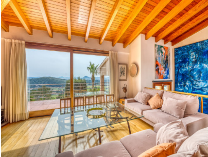
Relax with amazing views