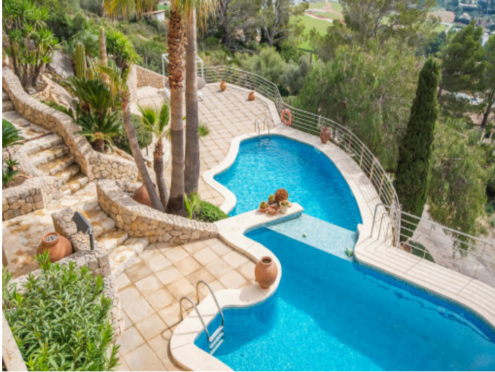
Pool on 2 levels