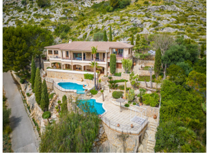
View of the villa