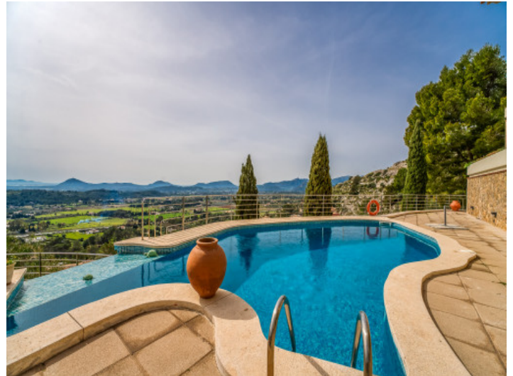
Pool with amazing views