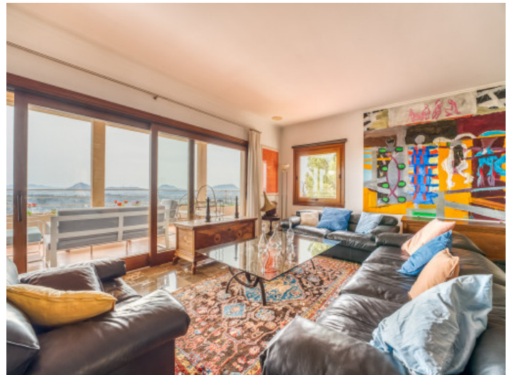
Elegant living area

All information is correct to the best of our knowledge. Errors and prior sale excepted. This prospectus is purely for information purposes. Only the notarized deed of sale is legally binding.