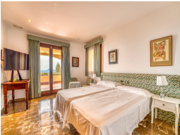
One of 5 bedrooms