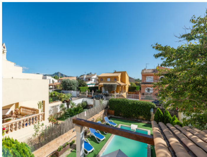
Views over the pool area