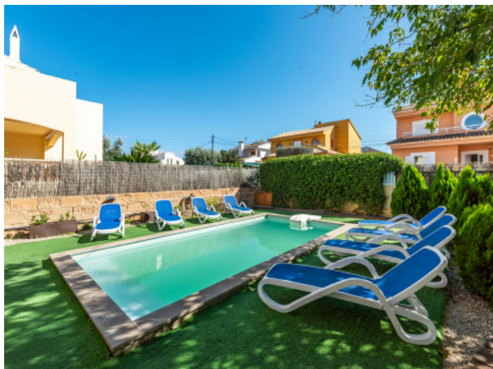
Pool area from the villa