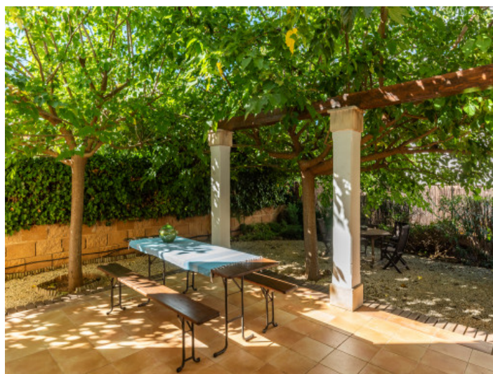
Rear terrace from the villa