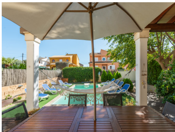
Terrace with dining area