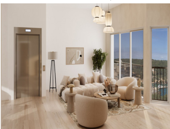
Elegant interior design