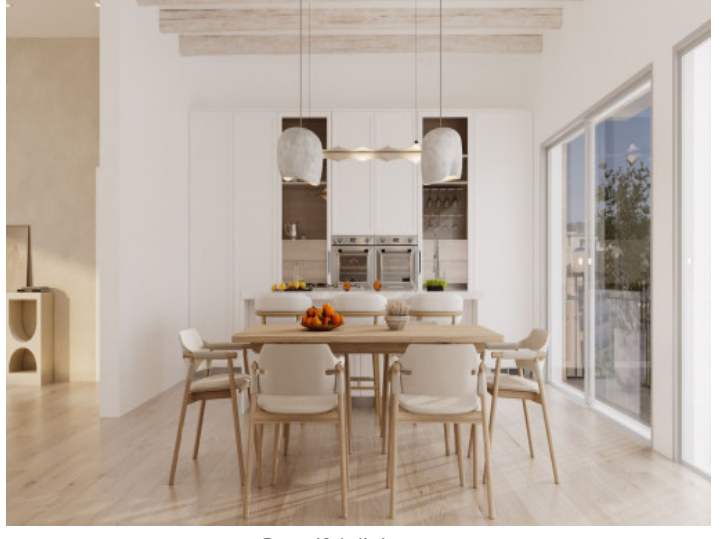
Beautiful dining area

All information is correct to the best of our knowledge. Errors and prior sale excepted. This prospectus is purely for information purposes. Only the notarized deed of sale is legally binding.