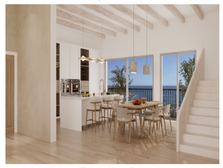
Kitchen with sea views