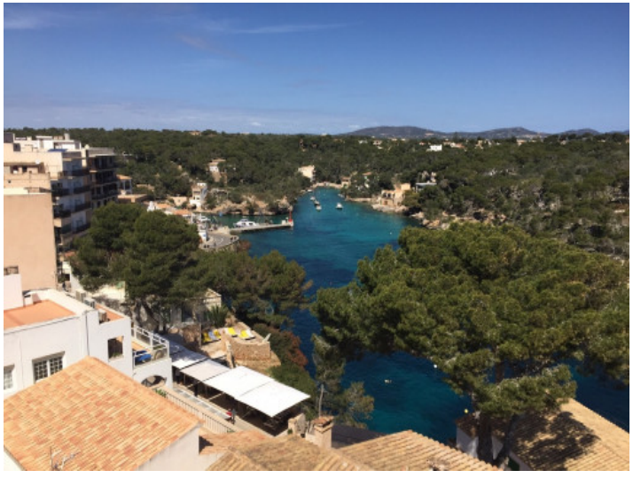
Location of the house