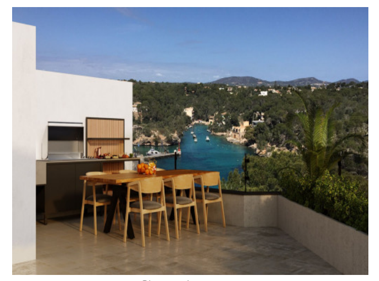
Bbq sea view terrace