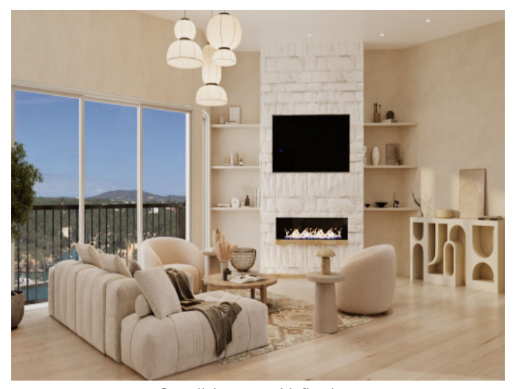
Open living area with fireplace