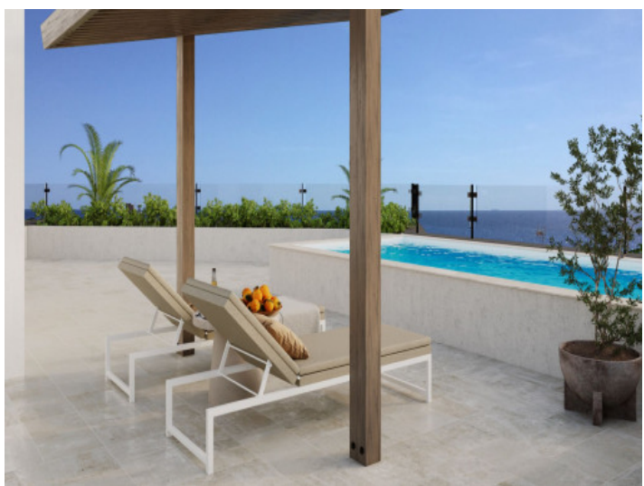
Fantastic roof terrace with pool