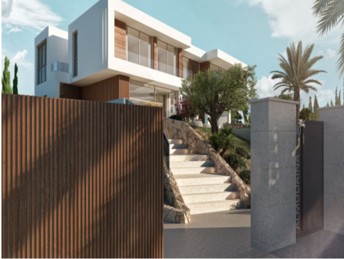
Access to the villa