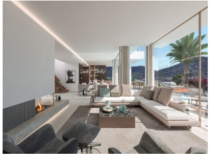
Lightflooded living area