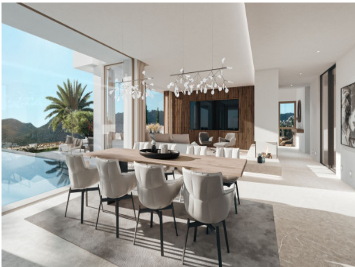
Stylish interior design