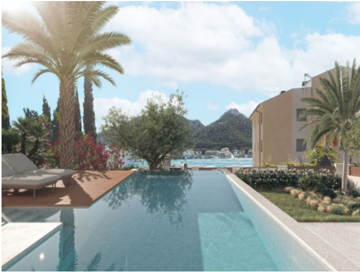
Infinity pool with harbour views