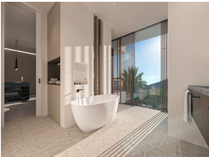
Bathroom with stunning views