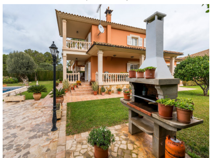
Lovely bbq area