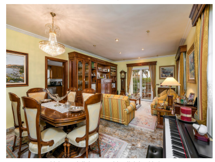
Living and dinig area with adjoining kitchen