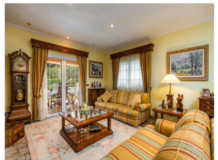
Living area with terrace access