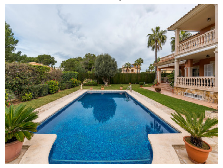
Mediterranean pool area