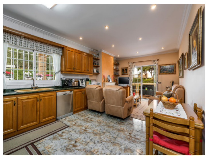
Kitchen with further living area

All information is correct to the best of our knowledge. Errors and prior sale excepted. This prospectus is purely for information purposes. Only the notarized deed of sale is legally binding.