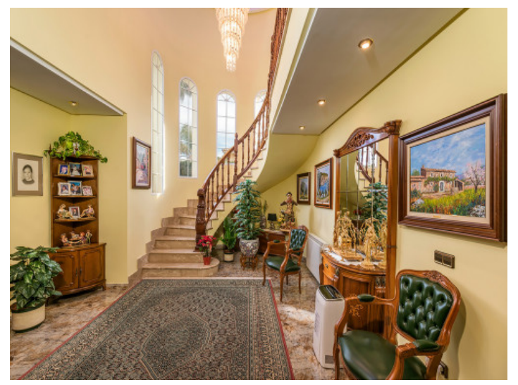
Impressive entrance hall