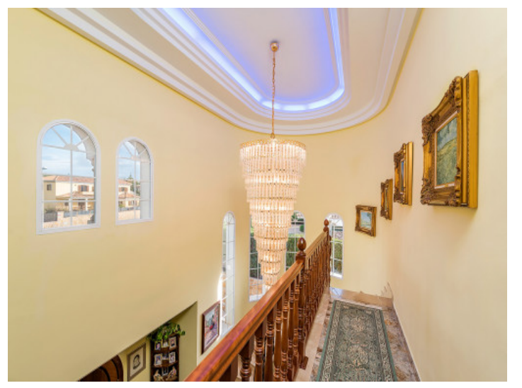
Staircase in the tower

All information is correct to the best of our knowledge. Errors and prior sale excepted. This prospectus is purely for information purposes. Only the notarized deed of sale is legally binding.