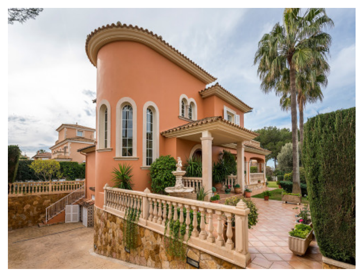
Front view of the villa