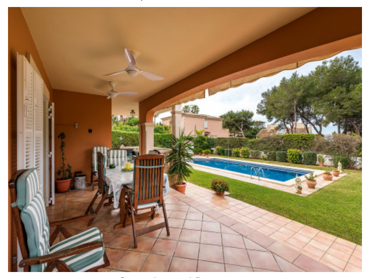
Covered ground floor terrace