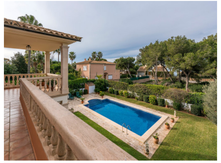
View to the garden