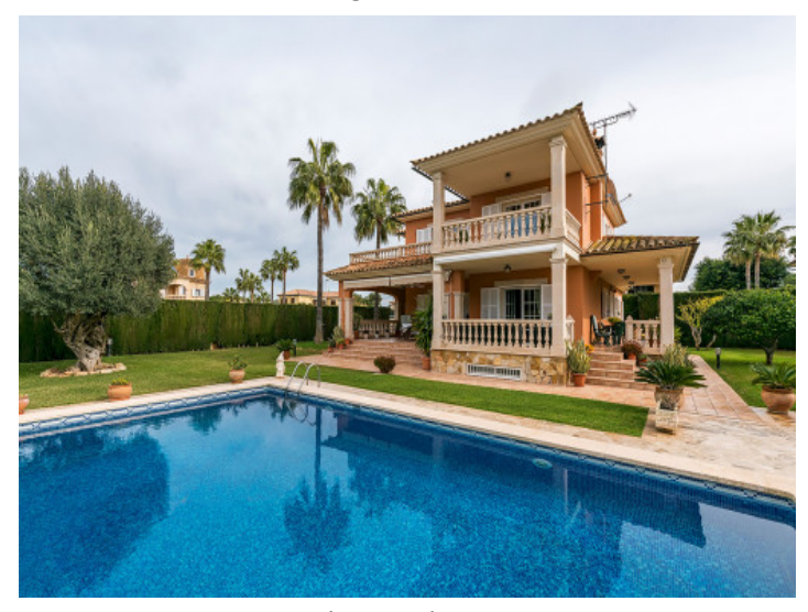
Large pool area