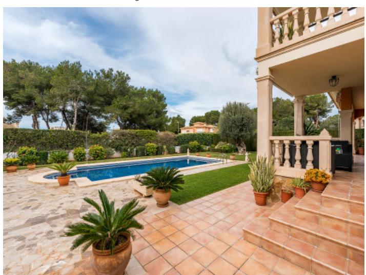
Well-tended outdoor area