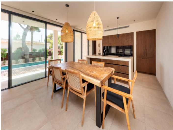
Dining area close to the kitchen