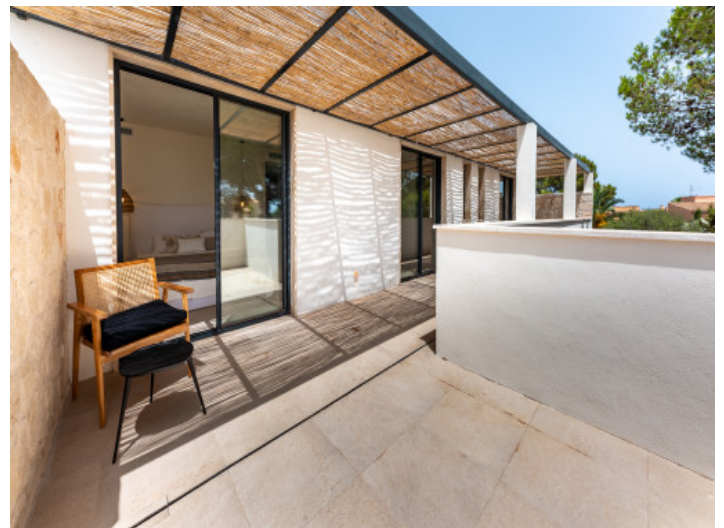
Upper floor balcony

All information is correct to the best of our knowledge. Errors and prior sale excepted. This prospectus is purely for information purposes. Only the notarized deed of sale is legally binding.