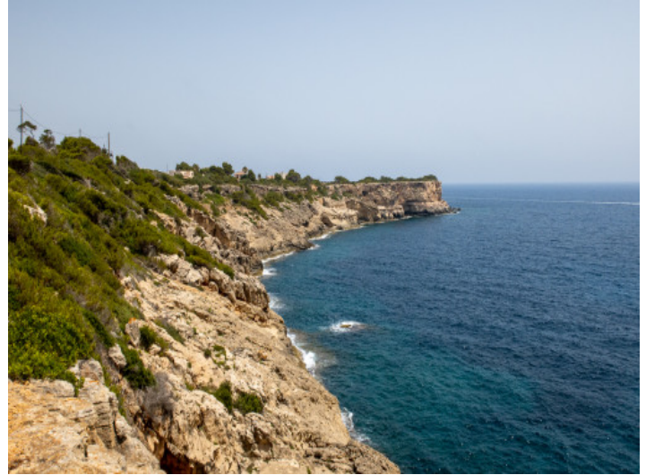
The coast close to the house