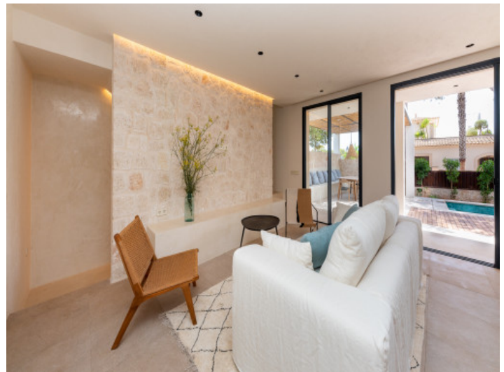
Bright living area