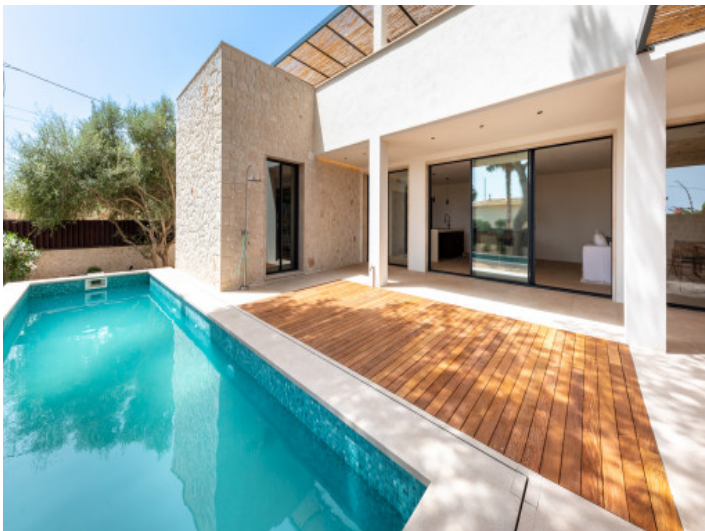
Comfortable family house