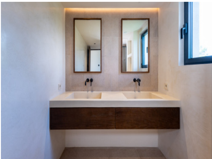
High quality construction