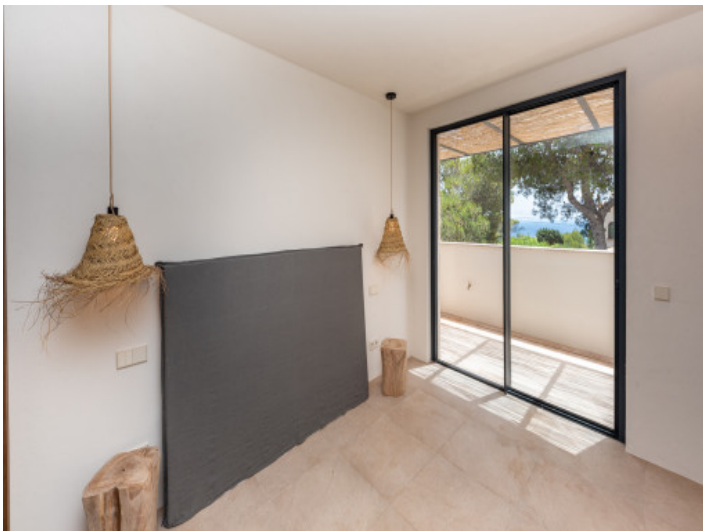
All bedroom with access to the balcony