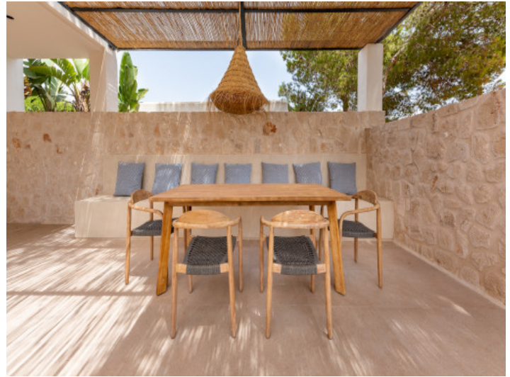
Cozy dining area