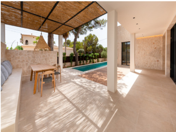
Large patio - garden