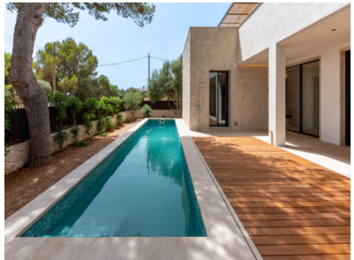
Lots of privacy