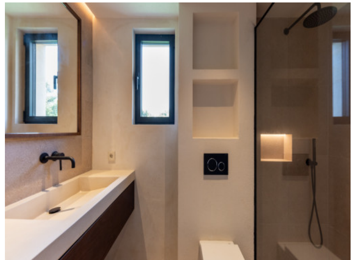
Modern bathroom en suite