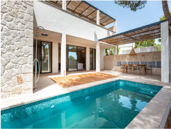
Very nice outdoor area with pool