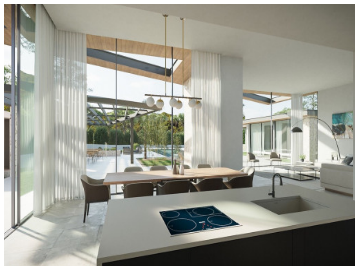
Elegant dining area and kitchen