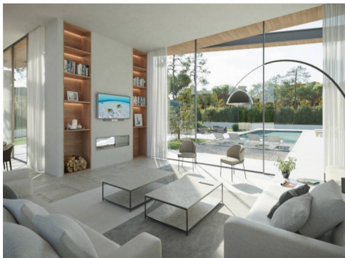
Light-flooded living area