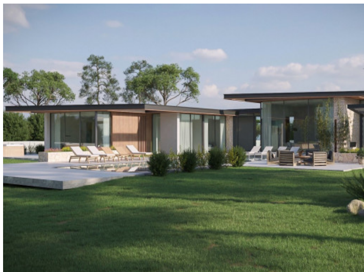
Spacious outdoor area with pool and garden