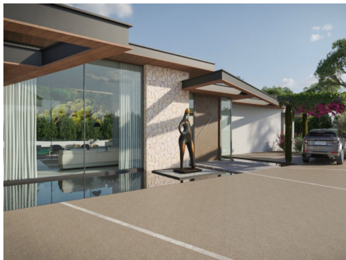
Modern entrance area