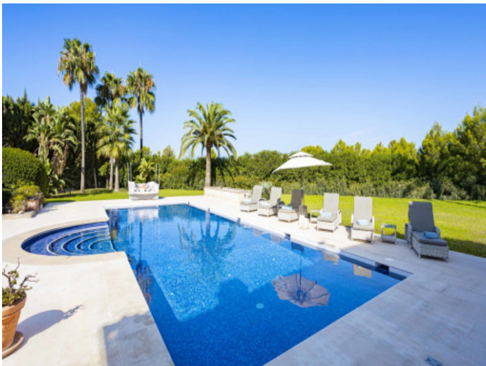
Pool is surrounded by a terrace