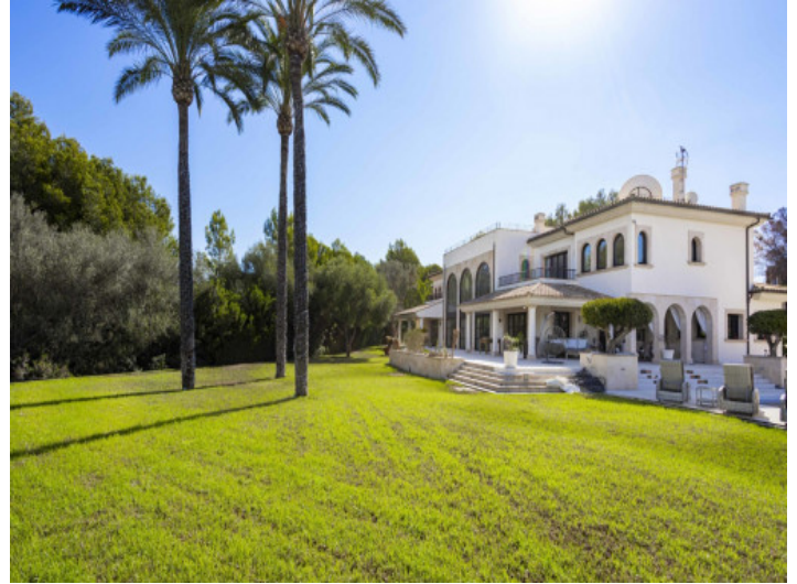
Impressive garden from the villa

All information is correct to the best of our knowledge. Errors and prior sale excepted. This prospectus is purely for information purposes. Only the notarized deed of sale is legally binding.