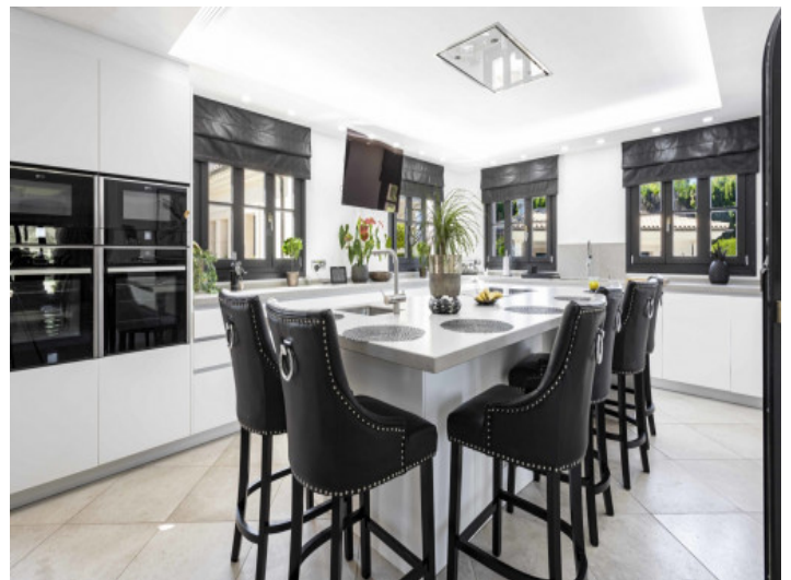
Open kitchen with dining area

All information is correct to the best of our knowledge. Errors and prior sale excepted. This prospectus is purely for information purposes. Only the notarized deed of sale is legally binding.