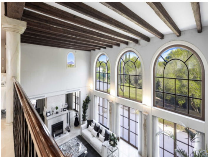
Views from the gallery to the living area