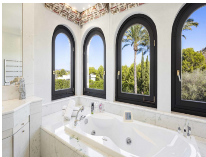
Bathroom with garden views