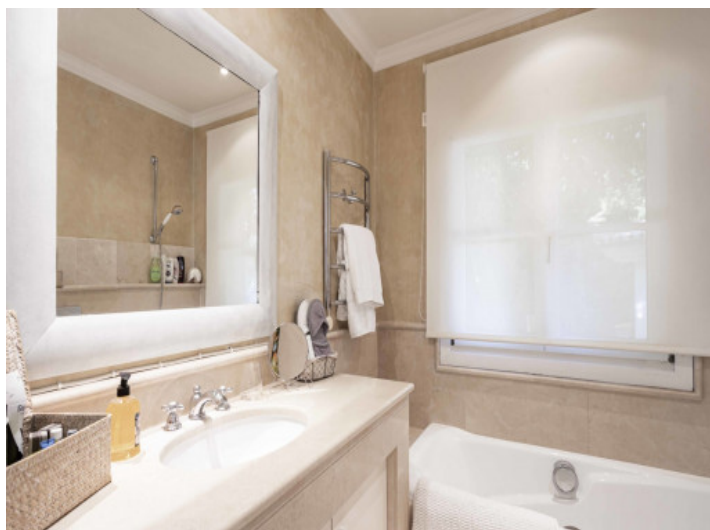
Bathroom with bathtub