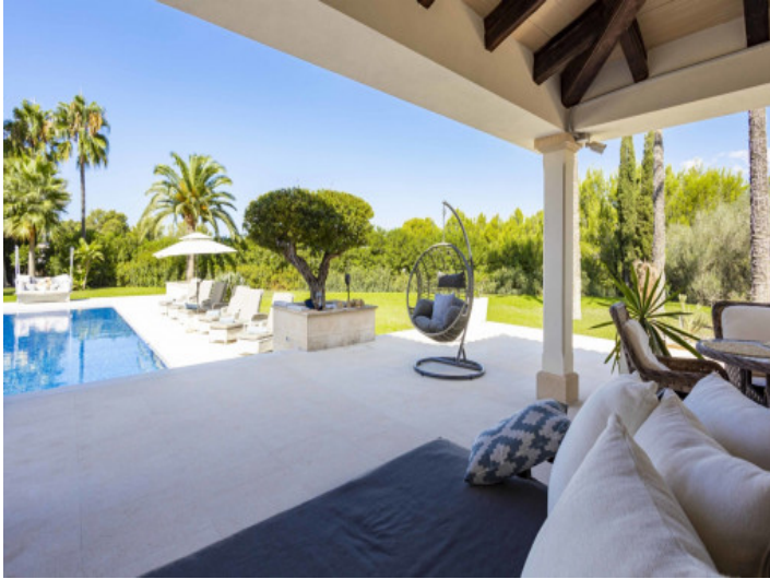
Views from the covered terrace to the pool area