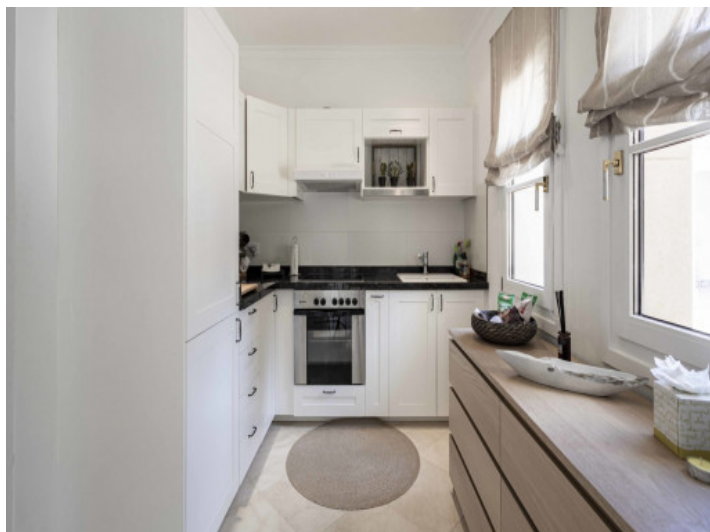
An other kitchen from the villa