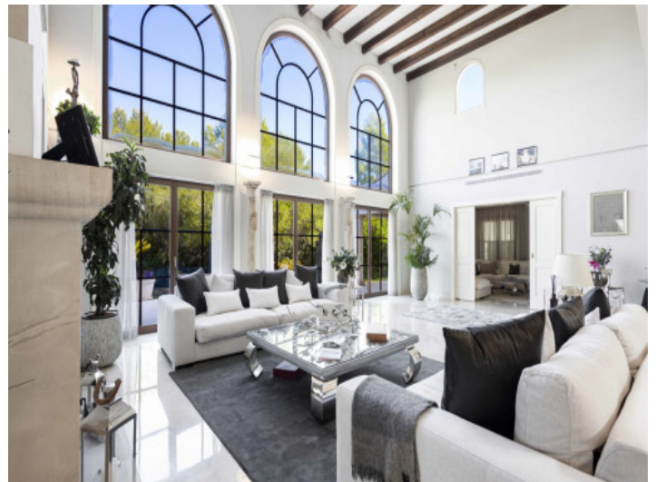
Impressive living area