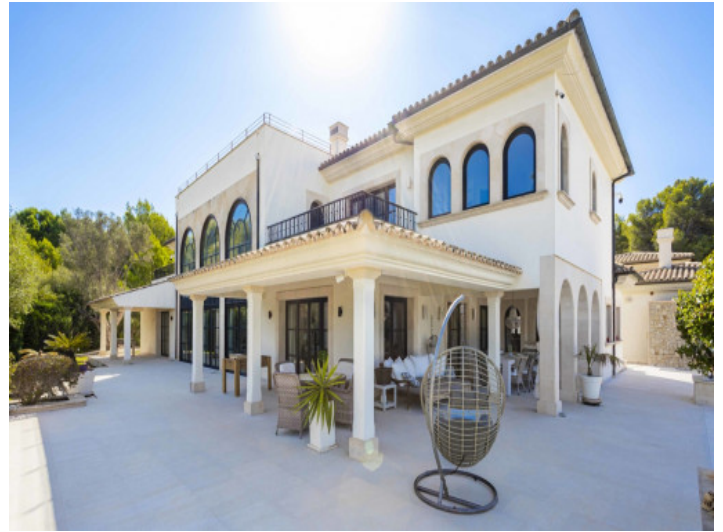
Covered terrace with lounge area