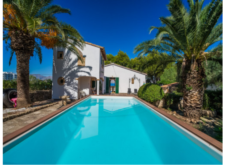
Pool area is surrounded by palma