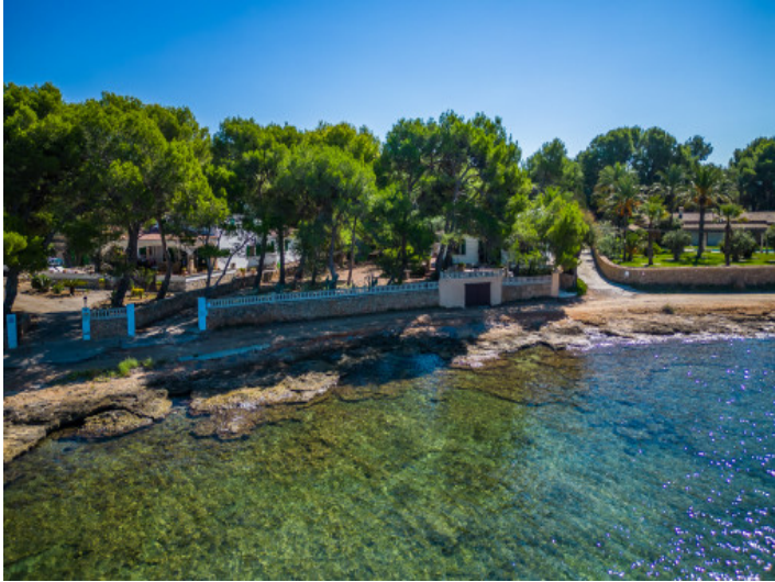
Villa in first sea line