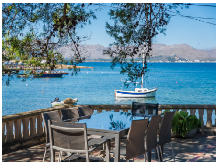
Gorgeous mediterranean sea views from the terrace