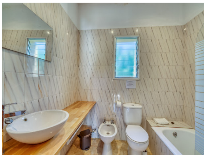
Bathroom with daylight