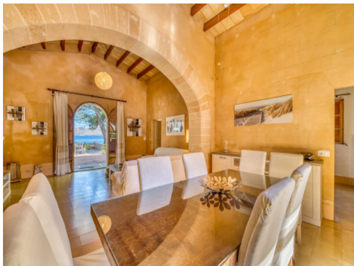
Open dining area