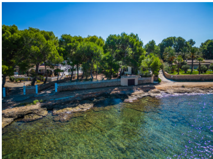
Villa in first sea line