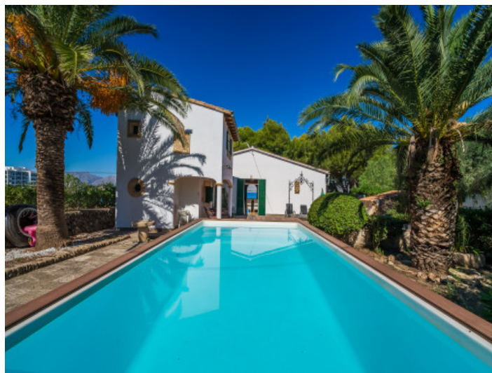
Pool area is surrounded by palma