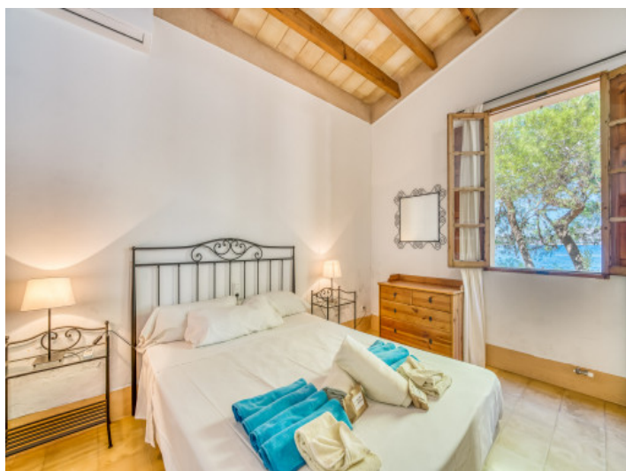
Bedroom with mediterranean sea views