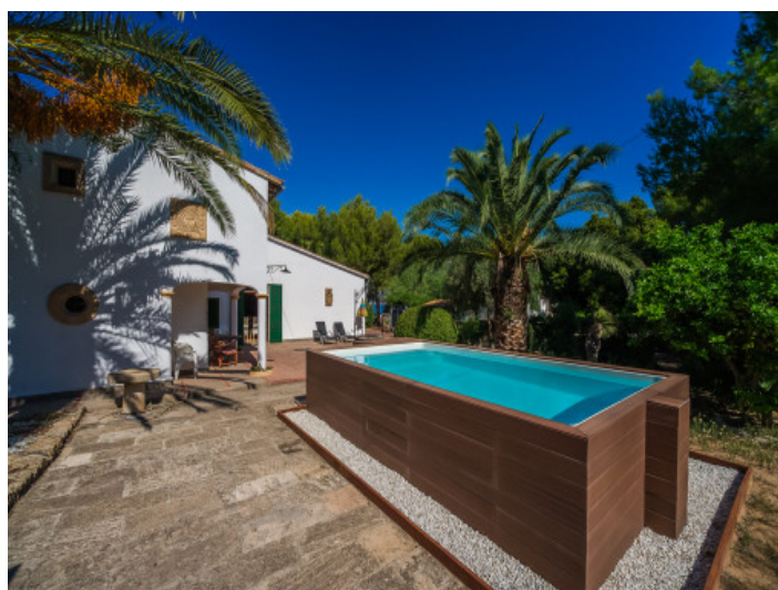
Pool is located on the terrace

All information is correct to the best of our knowledge. Errors and prior sale excepted. This prospectus is purely for information purposes. Only the notarized deed of sale is legally binding.