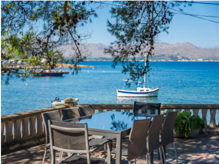
Gorgeous mediterranean sea views from the terrace